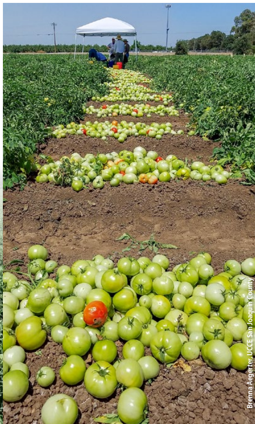
Brenna Aegerter, UCCE, San Joaquin County

In the small number of trials that directly compared grafted tomato plants to fumigation treatments in pathogen-infested fields, the grafted plants often gave higher yields. Other studies without fumigation treatments showed that pathogen resistance in some rootstocks was often strong enough to achieve high yields in pathogen-infested conditions.