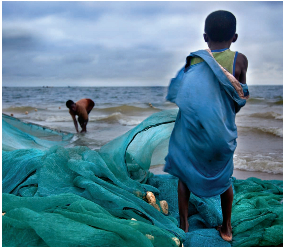
Children enslaved for fishing labor in the Brong Ahafo region of Ghana, 2010.