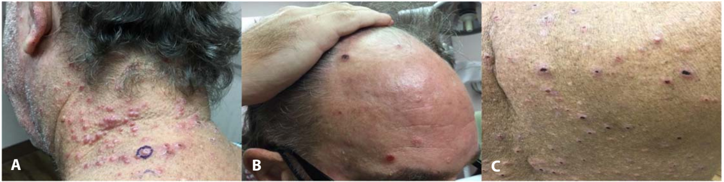
Figure 1. Clinical images. Papulonecrotic papules involving A) neck, B) scalp, and C) trunk.

face, scalp, trunk, axilla, and scrotum. The papules would heal spontaneously in several weeks. The lesions were pruritic, affecting activities of daily living and causing emotional distress. Previous clinical diagnoses included hidradenitis suppurativa, lichen planus, and neurotic excoriations. Therapy with topical corticosteroids, prednisone, adalimumab, and antihistamines was ineffective. He reported improvement with methotrexate and minocycline for suspected hidradenitis suppurativa, but the treatment was discontinued due to blue discoloration. The patient presented with an acute flare of widespread papulonecrotic papules involving the neck, scalp, trunk ( Figure 1 ) abdomen, and scrotum. He reported minor weight loss but denied all other systemic symptoms. Histopathology demonstrated an eroded epidermis and dermal necrosis [ Figure 2A ] with surrounding multiple non-necrotizing, sarcoidal granulomas ( Figure 2B ). Granulomas consisted mostly of larger cells, some with abundant cytoplasm and some with irregular nuclei, admixed with few smaller cells with sparse