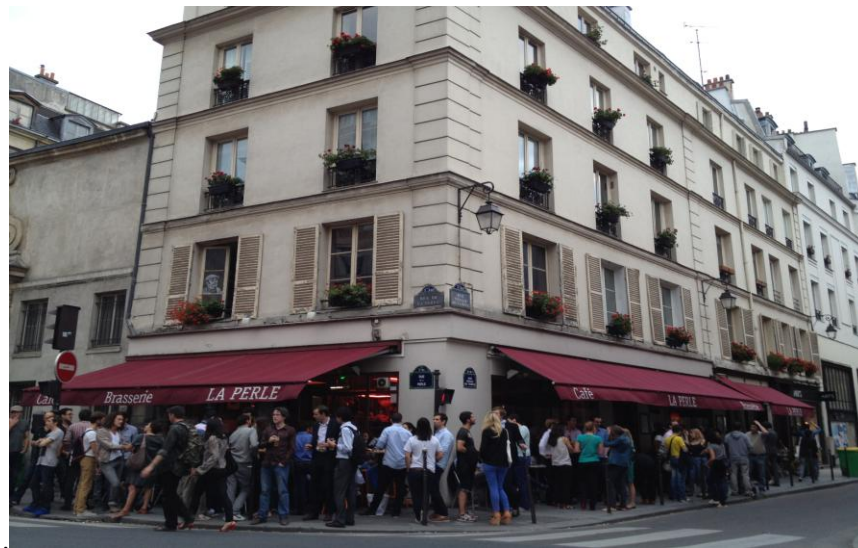
La Perle on Rue Vieille du Temple in the Marais 11

The fantasy world of high fashion Galliano inhabited and which he had come to represent was thrust against the reality of the indicting 10 video of his tirade at La Perle that could be played and replayed at will and on demand through various social media streams and countless communication outlets. By Lagerfeld’s standard and litmus test, the dam holding back Galliano’s inability to deal with the pressure of the fashion world’s pressures would have eventually cracked and broken. That it happened in public, in a popular bar on a busy thoroughfare in the Marais, on Rue Vieille du Temple, on the street (as it were) rather than at home was co-incidental.