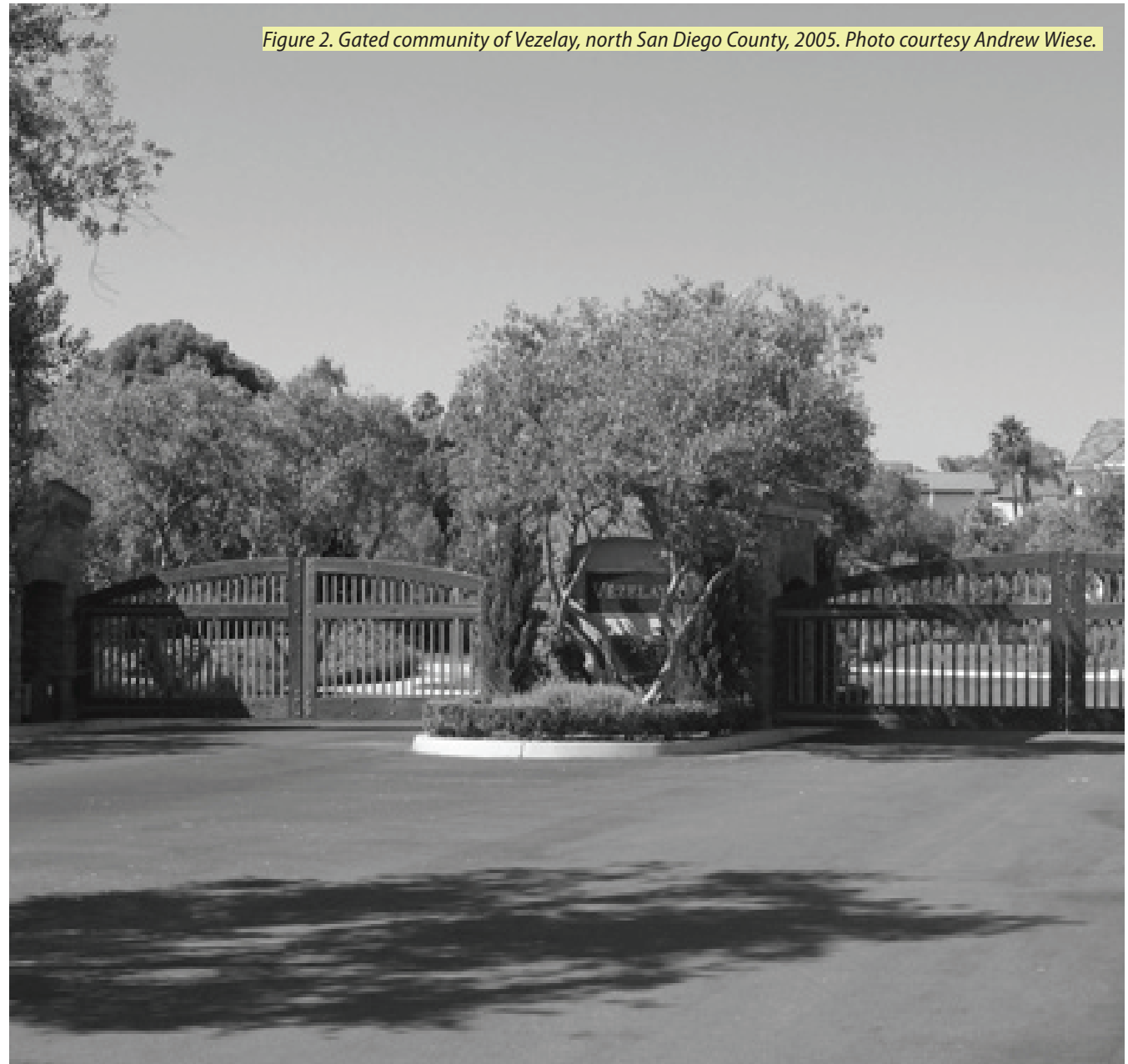
Figure 2. Gated community of Vezelay, north San Diego County, 2005.

This comparison suggests that we cannot blame