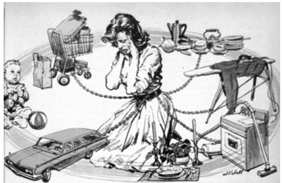
Figure 3. This depiction of a suburban mother's social claustrophobia appeared in Readers Digest in 1961, two years before The Feminine Mystique was published.

collective psyche. A slew of writings (not to mention films and novels) portray suburban women as alternately the victims and rulers of the suburban domain, Betty Friedan's Feminine Mystique foremost among them. While many share Friedan's bleak assessment of the emptiness of suburban housewifery, Whyte and others portray suburban women—and their children—as the social glue of community. Stay-at-home mothers had the opportunity to build social ties and mutual aid for one another, sometimes by virtue of their car-less isolation. The ways in which women's increasing turn to wage work impacted local community life is a topic awaiting exploration,