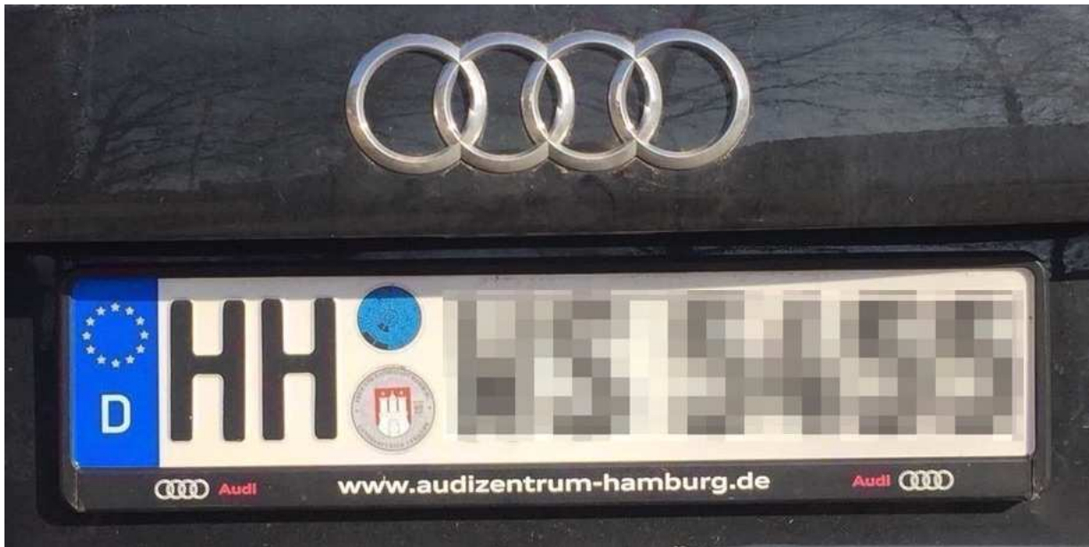
Figure 3. Hansestadt Hamburg License Plate

Hamburg residents. While these boosterist representations of networked mobility adorn walls and cars, indicating a smooth and frictionless geographical plain, one of the additional points we want to draw out here is the way that they also, at the same time, promote and reinvent urban history, tying a desired future to a selective memory of progress, openness and welcome.