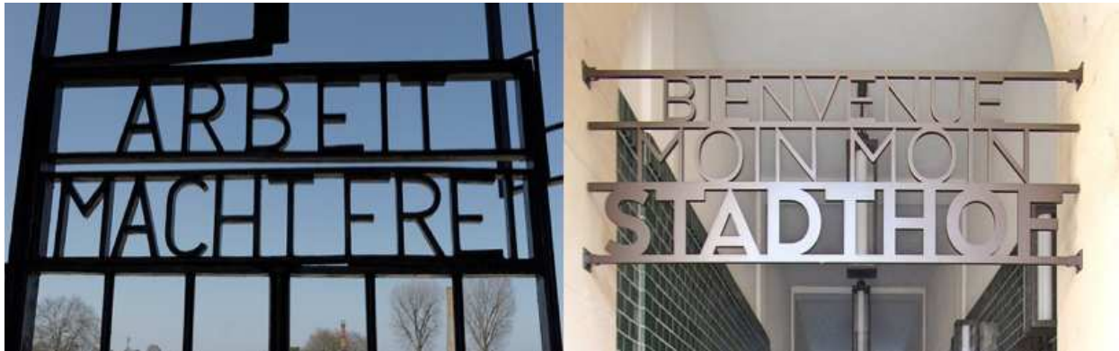
Figure 1. Left: Entrance gate at Sachsenhausen concentration camp; Right: Entrance gate at Hamburg's Stadthöfe

potential to disrupt the 'taken for granted' and 'business as usual'. When exposed or exhumed, spaces of danger pose an immediate threat to the existing order of space and time. Their emergence can cause remembrance and retellings—often leading to disruptive political practices and frictions impeding the smooth flows of capital.