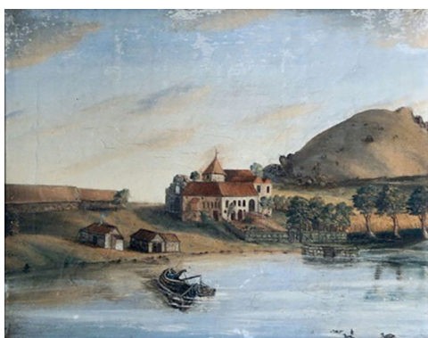
Figure 1. Anonymous 18th-19th century painting of Utstein Abbey.

In Utstein style analysis, any potential disaster may be characterized as a hazard with stored potential energy. The risk of conversion of that potential energy to an event with kinetic energy occurs either at a statistically estimable rate (eg, hurricanes), or due to stochastic triggers (eg, terrorism). The risk of an event becoming manifest can be modified through surveillance and prevention strategies, designed for each hazard . Should an event