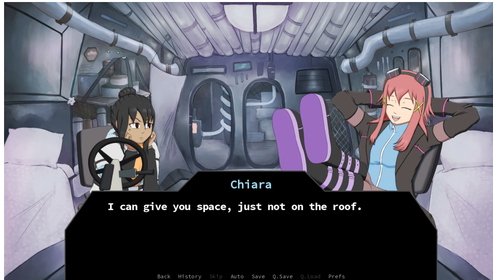
Figure 1.1: A screenshot of a moment in the current version of Tracks in Snow where Chiara (left) is expressing anger while performing her projected energy gesture and Rika (right) is expressing joy while performing her open flow gesture.

help facilitate the development of visual novels. As a result all the tools supporting the Tracks in Snow , namely Puppitor (further summarized in Section 1.2), are also written in Python. Before I keep going I just want to take a moment to appreciate Ren'Py for letting me do a bunch of things to it that I don't think it was ever supposed to be doing, and it let me 5 .