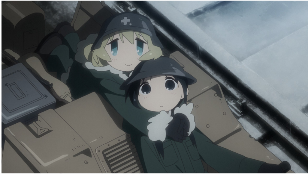
Figure 2.1: Yuuri (light hair) and Chiito (dark hair) from the Girls' Last Tour television show.

buried treasure in the desert). The two eventually bond as they look for the rumored treasure and much of the run time is spent exploring their relationship and the baggage each of them are carrying with them. In terms of tone and content, Tracks in Snow leans closer to Highway Blossoms than it does Girls' Last Tour as my main focus with the story has been the relationship between the game's two characters, Chiara and Rika, though like Girls' Last Tour , the relationship is ongoing rather than newly formed.