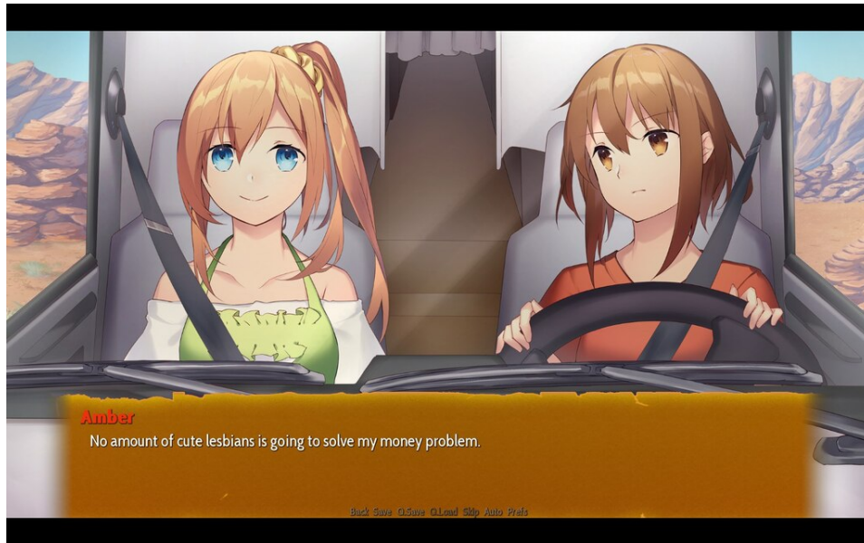
Figure 2.2: Marina (left) and Amber (right) in one of Highway Blossoms ' driving scenes.

begin to be filed against God of Vengeance by American Jews worried about how a play largely set in a brothel would make them look to the gentile audiences of Broadway [10]. Late in Indecent , Asch the character regrets the criticisms of Judaism he put in his play after the Holocaust resulting in “six million [having] left the theater” and feels a certain amount of responsibility toward those who’ve died while the play celebrates those same critiques and the story that brought them forth [10]. Indecent sees the true indecency of God of Vengeance in the way it was thrown under the bus to appeal to the perceived sensibilities of gentiles, ultimately for nothing as the United States Congress refused to take Jewish refugees fleeing the rising antisemitism in Europe [6].