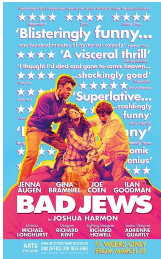
Figure 2.3: The, according to Transport for London, offending poster for Bad Jews ' 2015 production.

York Jews and the white, Christian values of Broadway theater [31]. Almost a hundred years later, another Jewish play would run into similar, if less punitive, claims of offence across the Atlantic Ocean.