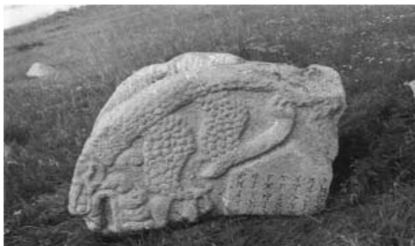
Figure 10. Monument with an Old Turkic inscription