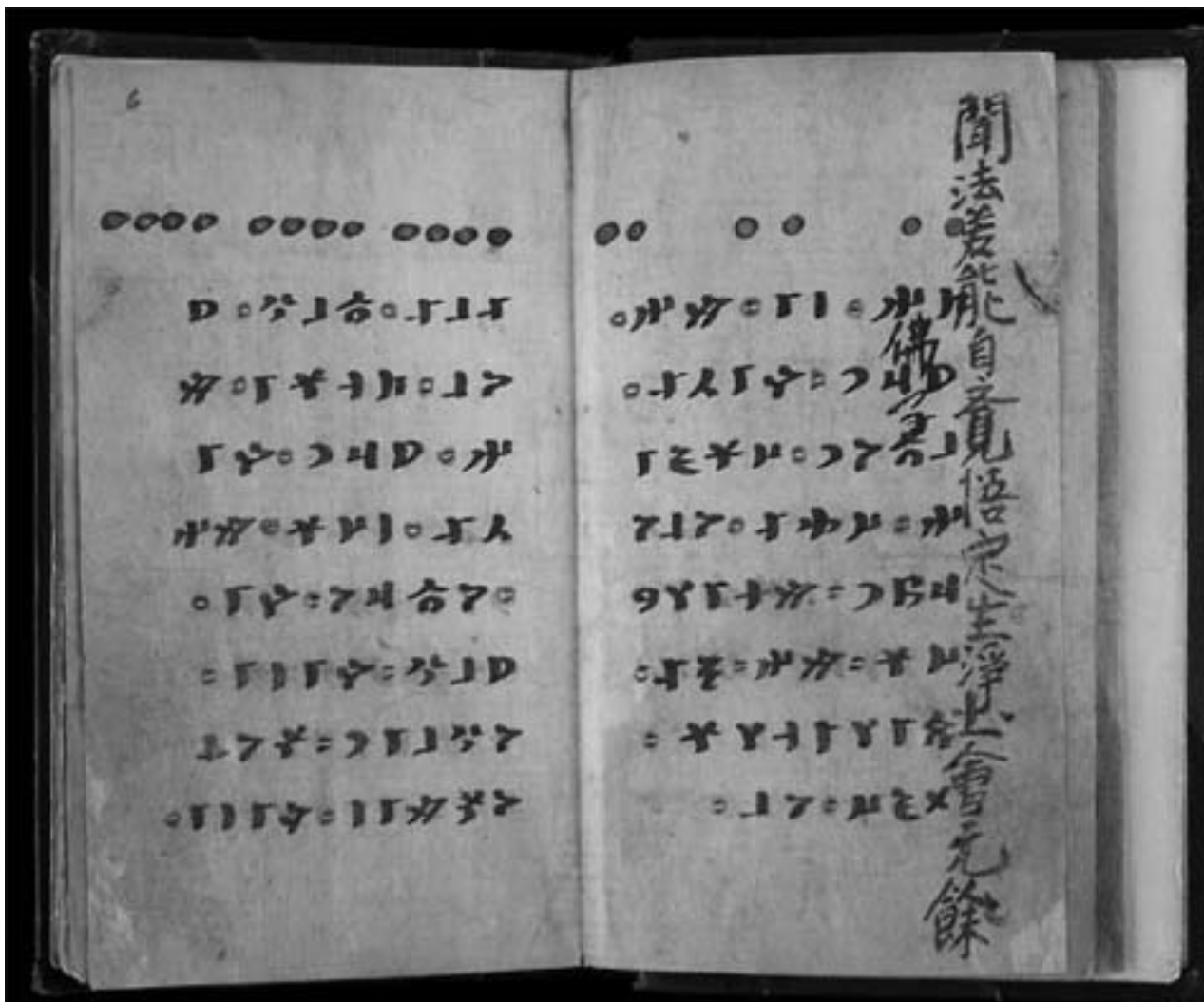
Figure 9. An Old Turkic manuscript.