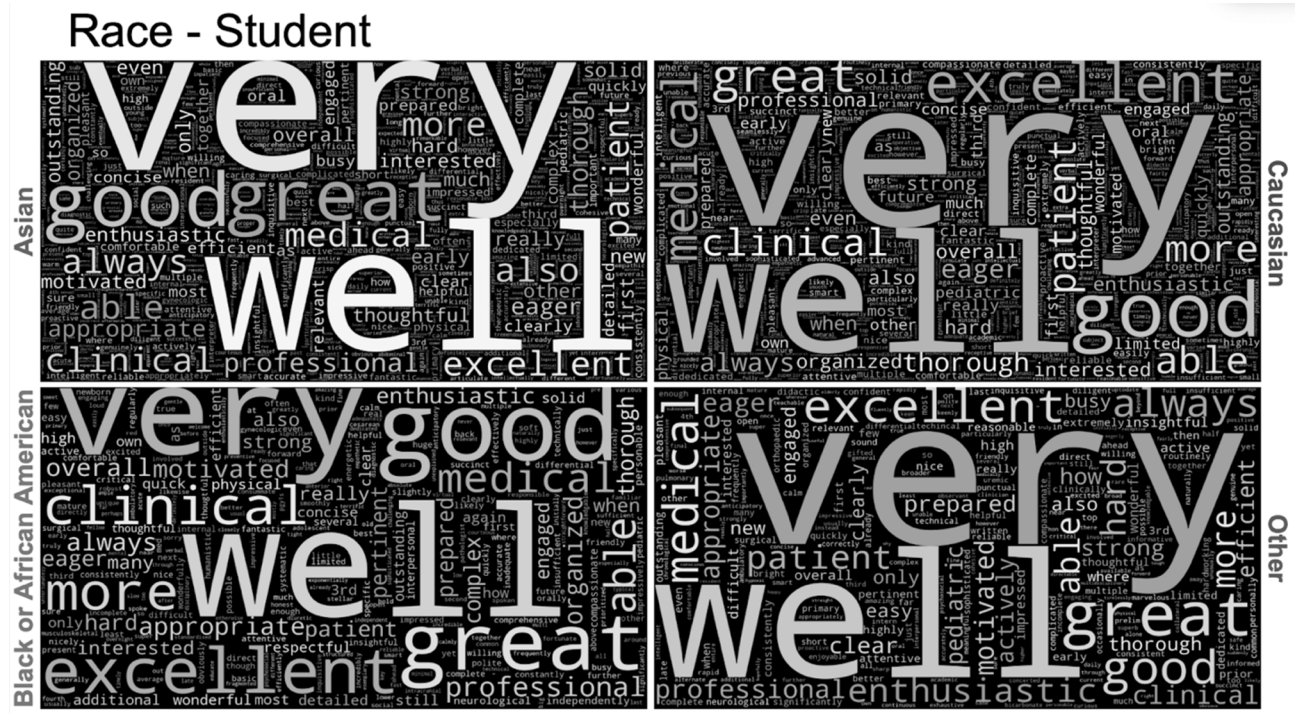
Fig. 2 Word clouds demonstrating word choice in narrative evaluations by race