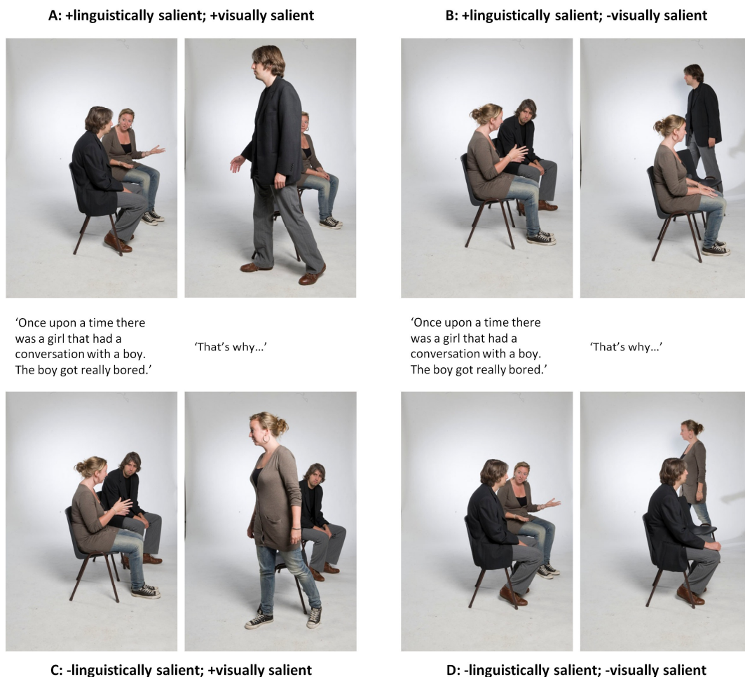
Figure 1: A stimulus item in four different conditions: (A) target referent (i.e. the person performing the action in the second picture) is both linguistically and visually salient; (B) target referent is linguistically but not visually salient; (C) target referent is visually but not linguistically salient; (D) target referent is neither linguistically nor visually salient. The corresponding context sentences are translations of the Dutch originals.

An additional 20 items serving as fillers and 4 practice items were constructed. These were similar to the experimental items, except that 5 items included only one character and another 9 items included two characters of the same gender. In addition, the characters sometimes had roles like 'a teacher' or 'a saleswoman'. The filler and