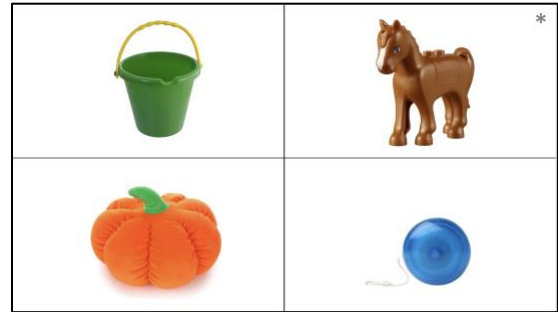
Figure 1: Sample displays from Experiment 1 for the lexical categories Fruits (top), Appliances (middle) and Toys (bottom).

All four objects were different in each display, rendering color redundant. As the only category with predictable colors, Fruits served as our baseline.