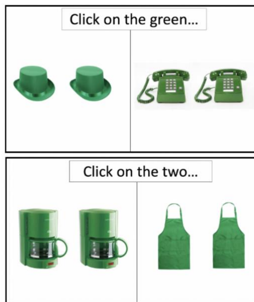
Figure 3: Sample Clothes vs Appliances displays from Experiment 2 from the Color (top) and Number (bottom) conditions.

In line with our predictions, participants selected the category with the stronger color association at comparable rates in the baseline condition (color typicality effect replicating the results of Rohde and Rubio-Fernandez, 2022) than in the two critical conditions (color association effect), with the difference not reaching significance (both p ’s > .05; for the full model output, see Table 2). Also as expected, there was a significant effect of Description ( p =.0006), whereby the lexical category with the stronger color association was selected more often following color descriptions than number descriptions (Fig. 4).