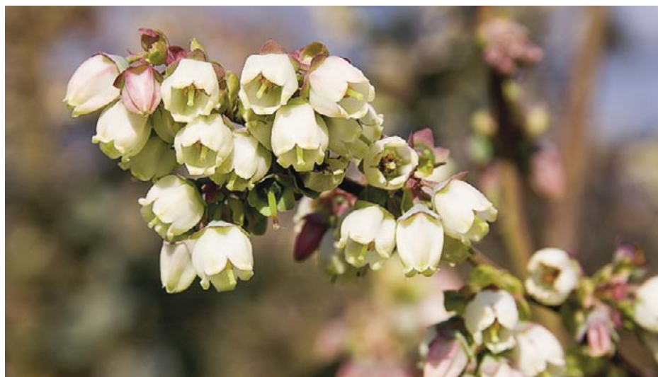
Jack Kelly Clark

Trial I. We initiated blueberry observation trials at the UC Kearney Agricultural Research and Extension Center (KREC) in Parlier in 1997, which have provided insight to key characteristics of numerous blueberry cultivars. The results of these trials indicated that southern highbush blueberry cultivars