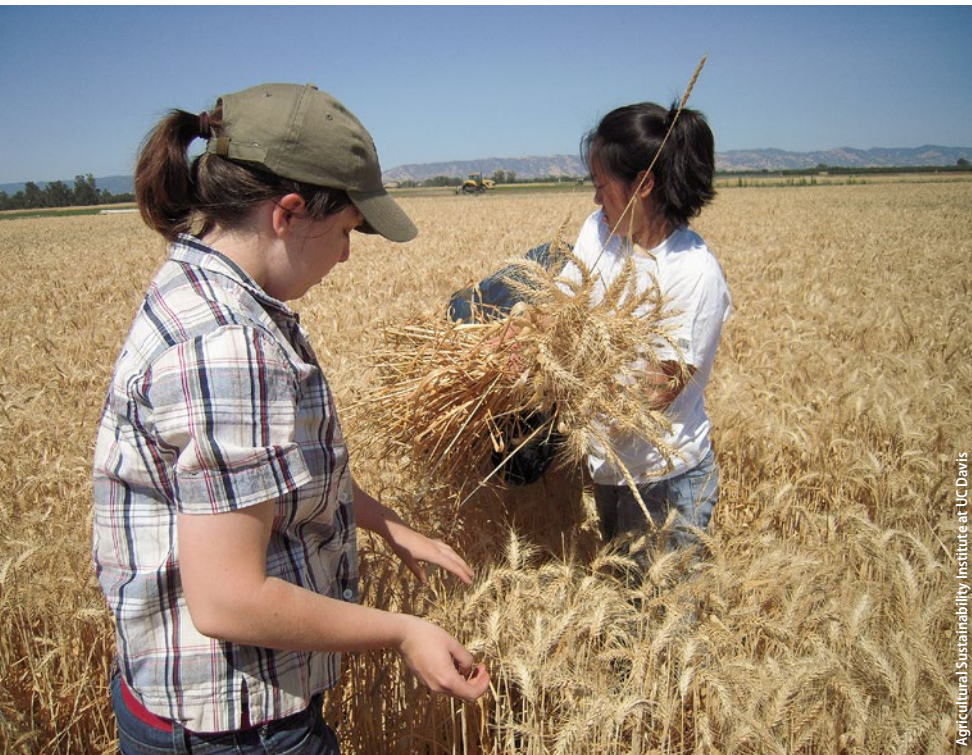
Agricultural Sustainability Institute at UC Davis

In its 20 years, the Century Experiment has demonstrated a unique value in generating climate-smart data — for example, which practices enhance carbon sequestration in California row crop soils, how irrigation can be managed to reduce greenhouse gas emissions, and what sensors help most in reducing water consumption. Future research will address how soil biodiversity, such as the symbiotic mycorrhizal fungi, can be harnessed to reduce water and nutrient inputs, and increase crop resilience. Researchers exploring mechanisms driving short- and long-term responses to global change can guide the development of decision support models that incorporate economic, agronomic, ecological and social trade-offs and provide support for decision-makers — growers, policymakers, researchers — to make management decisions in the face of increasing climate uncertainty. CA