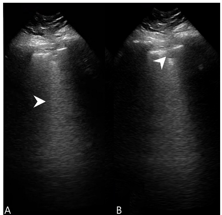
Image 2. A) Lung ultrasound showing a B-line (arrowhead), and B) lung ultrasound showing a subpleural consolidation (arrowhead).

This case serves as a reminder that Legionella pneumonia presents on ultrasound as an atypical pneumonia and should be considered on the differential.