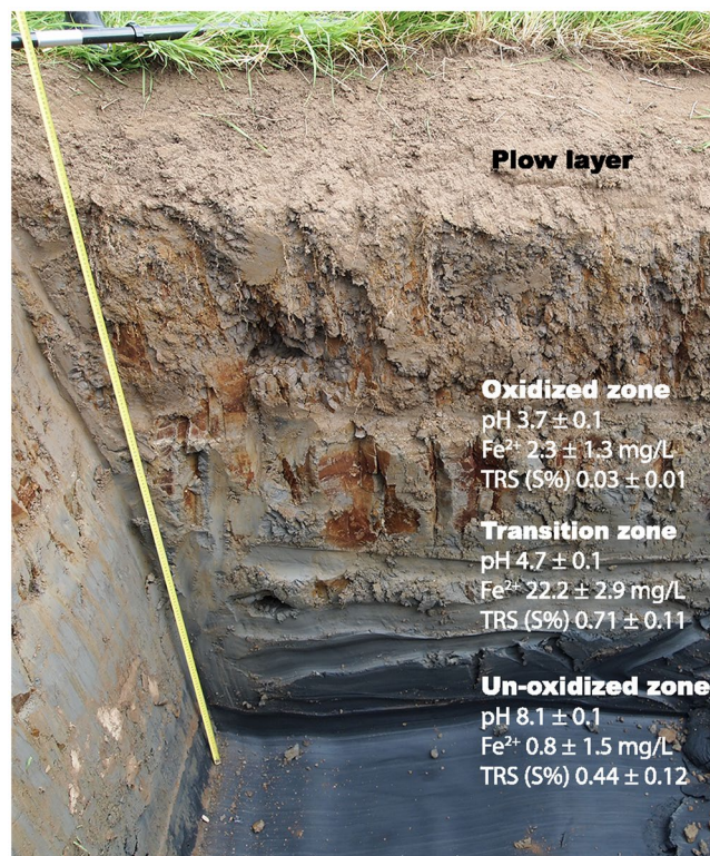
Fig. 1 Vertical soil profile of the transition from oxidized ASS to reduced PASS at the Risöfladan experimental field. Basic geochemical information; pH, \text{Fe}^{2+} , and total reduced sulfur (TRS); is provided for the oxidized (approximately 75–140 cm depth, n = 3 ), transition (approximately 140–190 cm depth, n = 3 ), and un-oxidized soil layers (approximately > 190 cm depth, n = 3 ).