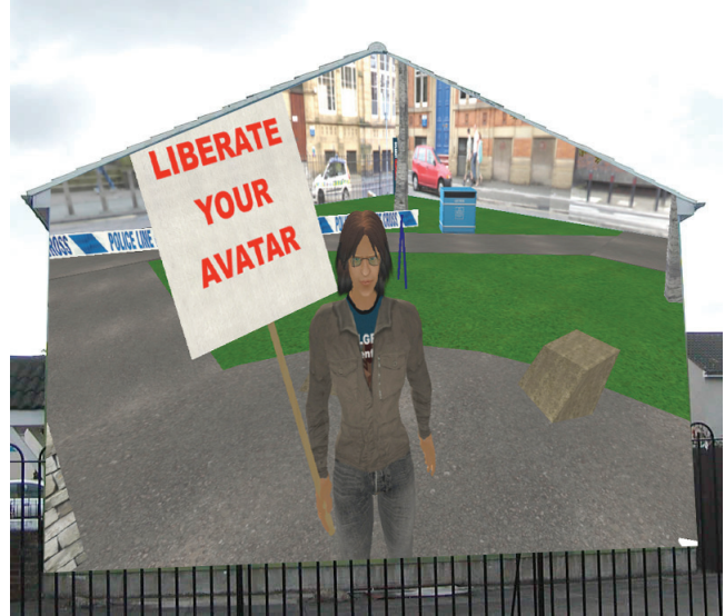
Fig 4. Proposed Second Life projection for ISEA Belfast 2009

The local audience formed an integral part of this installation that relied on user interaction and aimed to transcend boundaries through user-generated storytelling and memory building in a post-conflict society. The complete installation utilised three interface techniques. Charlotte Gould's motion tracking interface allowed visitors in Belfast to wear a large puppet-like copy of her unique avatar head. Covered in an array of LED lights that were tracked, participants could then control the movements of the Second Life avatar as a means of alternative navigation through a maze of chain-link garden fences. Paul Sermon's interface combined first life visitors and Second Life avatars within the same live video stream. By constructing a blue chroma-key studio in Second Life it was possible to mix live video images of online avatars with the audience in Belfast, enabling these participants to play and converse on a collaborative video stream simultaneously displayed in both first and second life situations. The third interface was developed by sound and media artist Peter