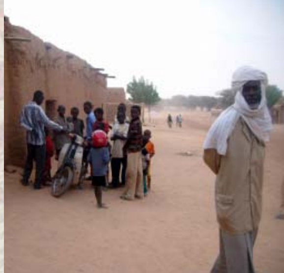
Where the road ends and the work begins.