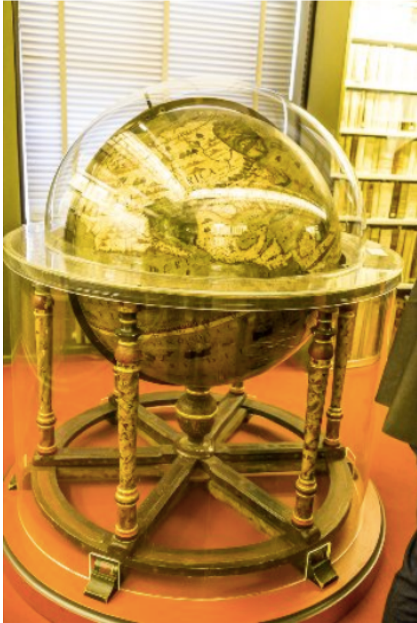
Fig. 1: A globe from the University of Helmstedt, currently held at the Herzog August Bibliothek in Wolfenbüttel. It is illustrative of the eclectic unity achieved by intellectual culture of neo-scholastic Lutheranism at places like Helmstedt. The globe's numerous inaccuracies are balanced by the sheer erudition on display and aestheticized complexity of its articulation. It combines an empirical-scientific worldview with a thoroughly Baroque attitude about the value and presentation of knowledge.