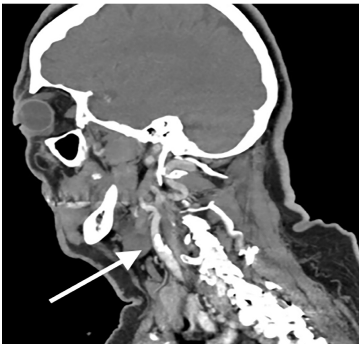
Image 1. Sagittal view of computed tomography with angiography of the head and neck identifying an intimal flap in the left internal carotid artery consistent with a carotid artery dissection.

Including carotid artery dissection in our differential for unilateral jaw pain in patients with no intraoral, dental, or facial abnormalities on physical exam.