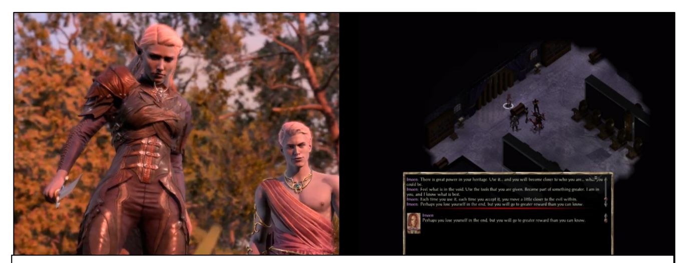
In Baldur's Gate 3 (left) and Baldur's Gate II (right), the protagonists are encouraged into corruption by dream figures. BG3 screenshot from Drowsy via YouTube (see works cited for more info), BGII screenshot from my own playthrough.

crucial in the PC's self-development, for within these scenarios we witness a tempting of the self, an allurement to a darker internal seed. Self-development here is represented in its negative form: self-degradation for the sake of power. Where choice comes in is in our reaction to these tempting influences. Are we willing to keep using the tadpole's powers for convenience and authoritative will? Will we give into our blood and take the power that seems so rightfully ours?