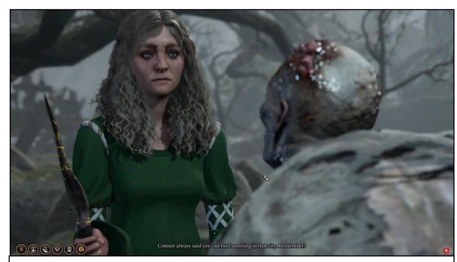
Mayrina holding Auntie Ethel's wand in front of her husband's reanimated corpse. Screenshot from RPGGirl's video on YouTube (see works cited for more info).

The above description is eerily similar to the last we see of Mayrina: with her wand in