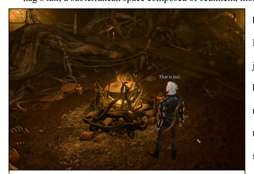
A character stands in the middle of Auntie Ethel's trophy room. The in-game text reads: "That is foul ", referring to the bubbling pot in the center of the picture. Screenshot from my own Baldur's Gate 3 playthrough.

Another example of cooking in Auntie Ethel's quest takes place once you descend the stairs hidden behind her illusive oven. Upon your descent, Tav and her party find they are in the hag's lair, a subterranean space composed of sediment, moss, and plants. The whole area is