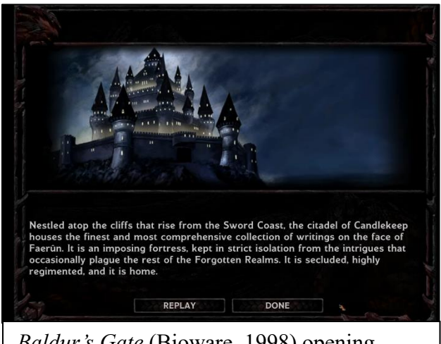
Baldur's Gate (Bioware, 1998) opening.

by town residents to meet with their adoptive father as soon as possible. When we finally meet with Gorion, he immediately orders us to pack our things so we may leave Candlekeep with him. After exchanging a few words, your character relents. Soon after, the two leave the city gates and enter the surrounding forested lands.