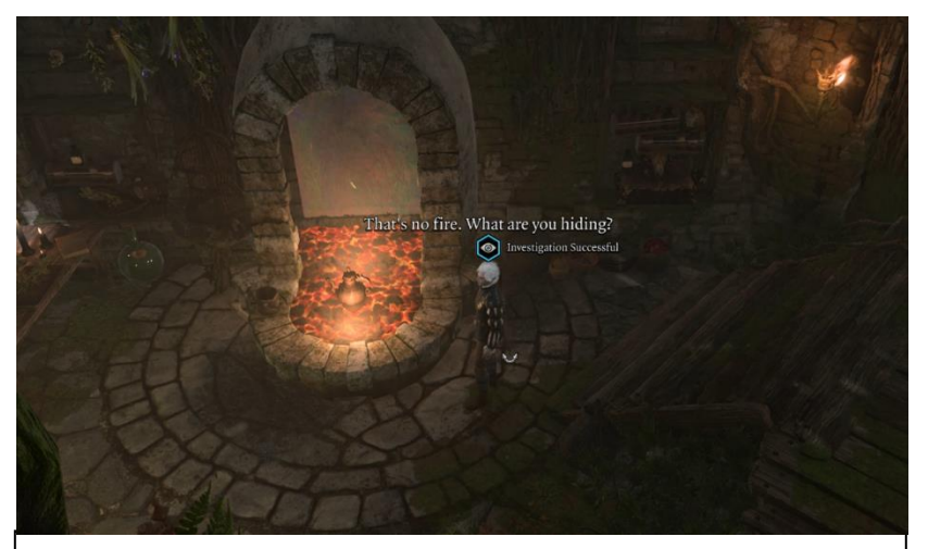
A character spots the illusory wall behind Auntie Ethel's oven. The in-game text reads: "That's no fire. What are you hiding?". Screenshot from my own Baldur's Gate 3 playthrough.

investigation check, which just means the dice is rolled for your character without your active involvement. If you pass this check, we discover the back wall of the oven is illusory, giving you the option to sneak past it. Once you walk beyond this magical false