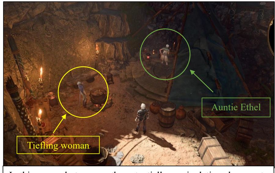
In this screenshot, we see the potentially manipulative placement of Auntie Ethel in the Druid's Grove.

(demonic-humanoid hybrid) who offers us soup—quite a kind gesture considering she, like the other tieflings in the Grove, is a refugee with meager supplies. As such, we can gather that Auntie Ethel's physical