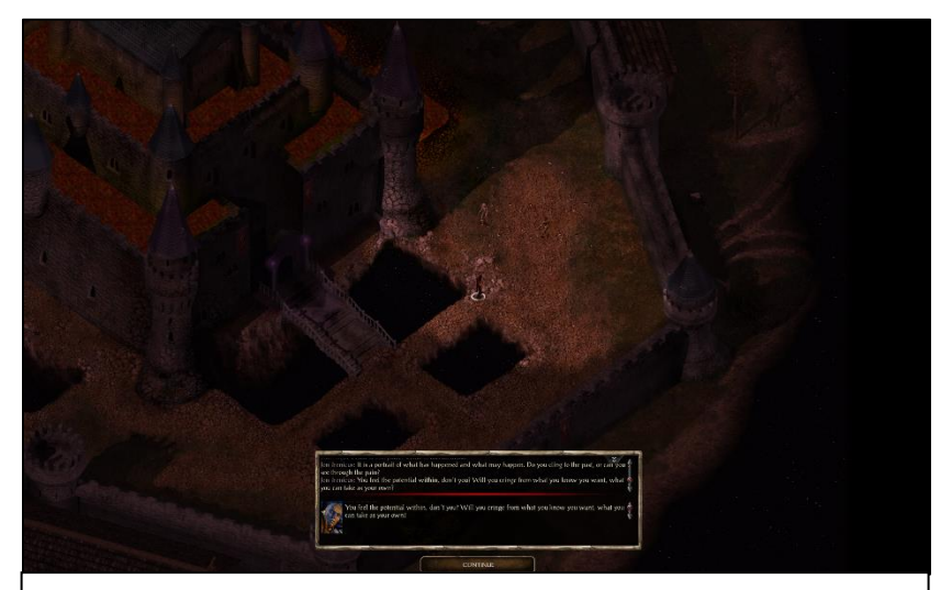
In this screenshot, we witness Gorion's Ward/the Bhaalspawn dreaming of Candlekeep. We listen to Irenicus as he says the words described to the left of this picture. Screenshot from my own Baldur's Gate II playthrough.

reality of the situation. He asks us, "You feel the potential within, don't you? Will you cringe from what you know you want? What you can take as your own?" ( Baldur's Gate II ). This is a prime example of the extraction form. Irenicus is attempting to pull from