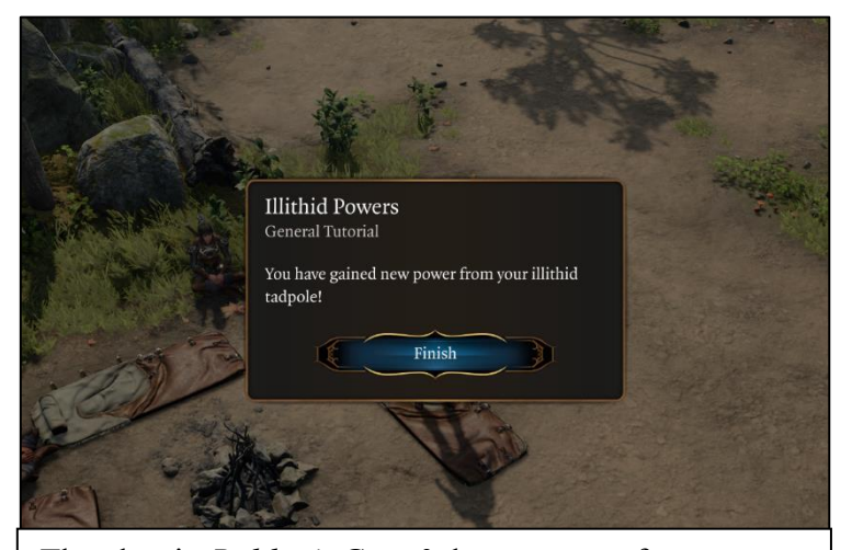
The alert in Baldur's Gate 3 that appears after you dream of this person. In-game text reads: "Illithid Powers (General Tutorial): You have gained new power from your illithid tadpole!"

our tadpole abilities, and this is where dreams come in. Every time you use your new powers, you have strange dreams once night comes. In them, a figure our PC desires evaluates them, gauging whether we are ready or willing for whatever they have planned for us.