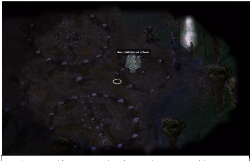
This brings us to the end of the encounter between our PC, Gorion, and this dangerous