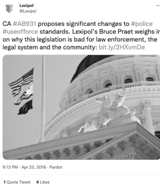
Figure 6. Lexipol Tweet

In 2019, California lawmakers proposed and passed a successor bill, AB 392, known as the Act to Save Lives or the Stephon Clark Law. 296 Under the new law, which went into effect on January 1, 2020, law enforcement officers in California may use deadly force only when “necessary.” The new law also clarifies that officers’ conduct leading up to the use of force is relevant in determining its necessity and requires that prior to using deadly force, “officers shall . . . use other available resources and techniques if reasonably safe and feasible to an objectively reasonable officer.” 297