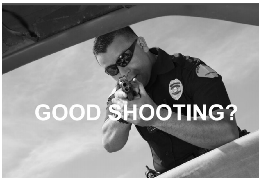
Figure 5. Image from Lexipol Educational Materials

Lexipol’s warrior stance is apparent in its repeated characterization of police killings as “good shooting[s].” For example, in a training about “what’s next” after “I just shot someone,” Lexipol co-founder Bruce Praet justifies police violence, saying that “99.9%” of police shootings are what he calls “good shooting[s].” 269 Lexipol’s trainings even provide glamorous visuals of “good shooting[s],” like the one in Figure 5 which was included in a PowerPoint presentation by Bruce Praet. 270 This photograph, which is captioned, “GOOD SHOOTING?,” features an officer shooting at close range into a vehicle.