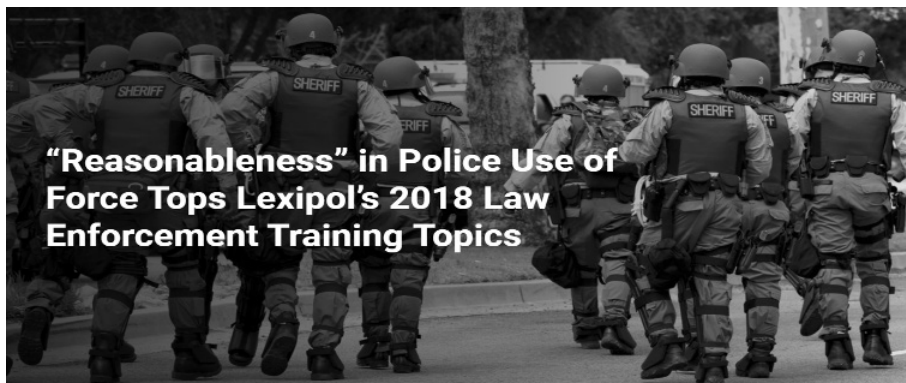
Figure 4. Image from Lexipol Educational Materials

The content of Lexipol's trainings primes and prepares officers to use force. Lexipol counsels officers to “train like you fight.” 261 Departments should place officers in “[i]ntensive and realistic scenario-based training” and those “scenarios” in the use-of-force context are often of officers shooting and killing people. 262 It is important that these scenario-based trainings teach officers “to fight” and “to win.” 263 To do so, as Lexipol's cofounder Gordon Graham explains, officers must be primed and ready to use violence in response to threat: