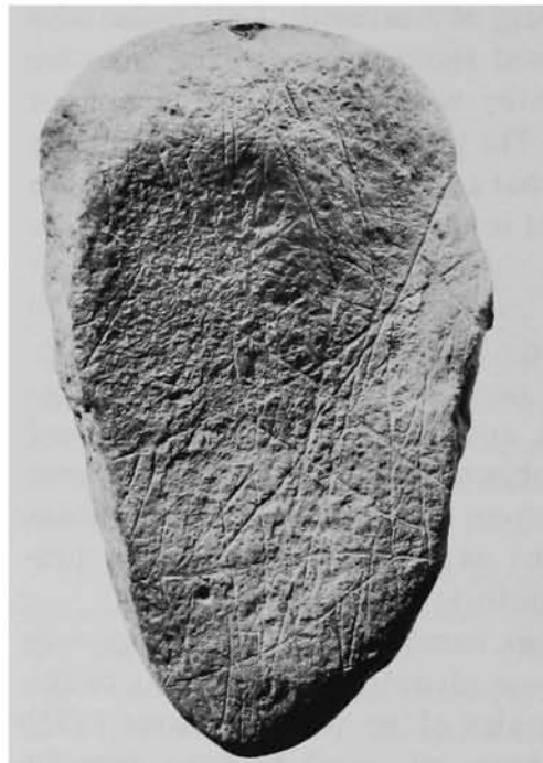
Fig. 1. Incised stone from site CA-Sie-30, Sierra Nevada, California. Drawings and photos of opposite faces.

represented by the seven small triangles (teeth of either upper or lower jaw?) near the bottom of the likeness proposed as a face.