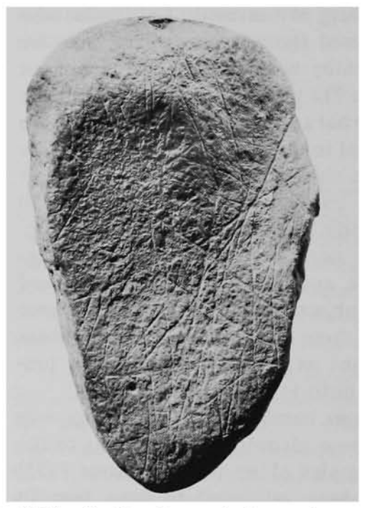
Fig. 1. Incised stone from site CA-Sie-30, Sierra Nevada, California. Drawings and photos of opposite faces.

represented by the seven small triangles (teeth of either upper or lower jaw?) near the bottom of the likeness proposed as a face.