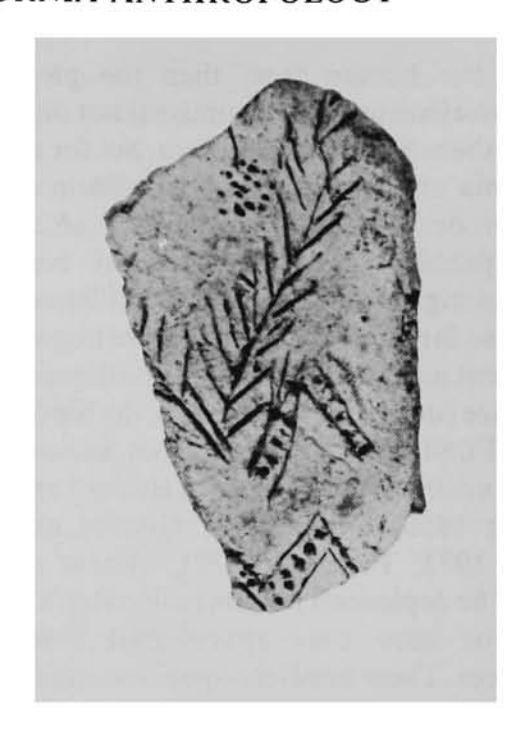
Fig. 2. Drawing and photograph of incised baked clay tablet from site CA-Sie-30, Sierra Nevada, California.