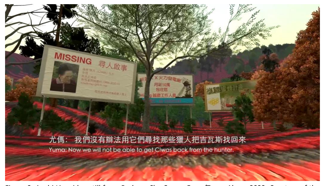
Figure 3. Anchi Lin, video still from Perhaps She Comes From/To __ Alang , 2022.

It was important for me to incorporate the worldview of gaga into this work. The Squliq saying "cinnunan ni utux kayal qu rhzyal" means "the land is woven by spirits of the land," which may be understood in philosophical, personal, and cultural terms. <sup>6</sup> The terrain in the virtual landscape recreates my vague memories of my ancestral land in Nantou (Fig. 3). I made it by projecting the image