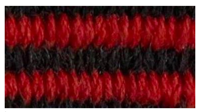
Figure 4. Sample of material woven by the artist then scanned and inserted into the virtual space as the land for Perhaps She Comes From/To __ Alang , 2020.

of a piece of woven fabric that I created during a one-day workshop using the bow-harp technique (Fig. 4). The red dye in the fabric is traditionally extracted from the shoulang yam often found in the high-altitude mountainous areas in Taiwan. Once scanned, this tiny piece of fabric extended the idea of the "woven land" and became the texture of the terrain in the virtual landscape.