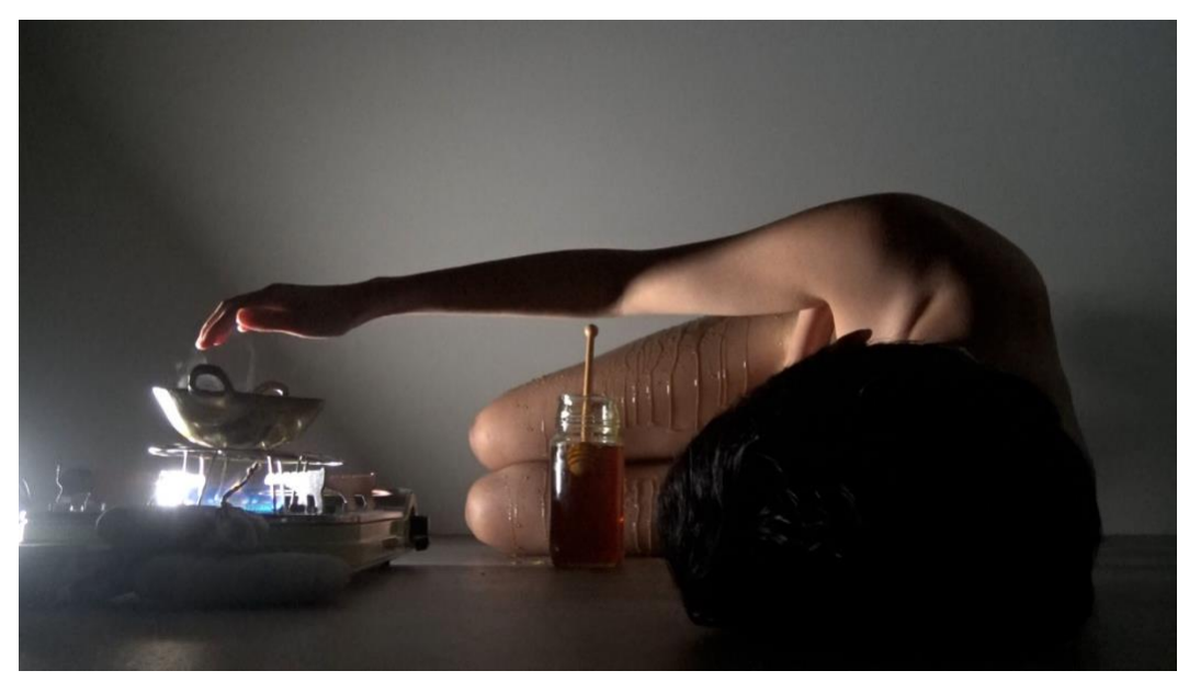
Figure 2. Anchi Lin, video still from Perhaps She Comes From/To __ Alang , 2022.