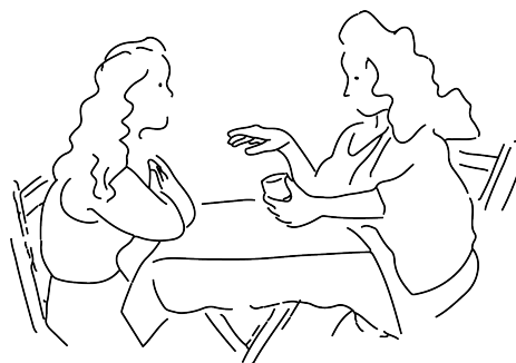
Figure 1: The setting of a coffee cup fortune-telling session

This study used naturalistic fortune telling sessions as the design. Turkish fortune telling sessions provide a viable setting to assess temporal information. In Turkey, coffee fortune-telling is a widespread practice interwoven in daily life and considered by most people as an occasion for creating social interaction. Moreover, Turkish coffee drinking and fortune telling sessions create an enjoyable, warm and sometimes humorous social environment. In Turkish culture, it is very common for people to tell others' fortune by examining the coffee cup after drinking coffee. Both the fortuneteller and the listener (the person who drank the coffee) are engaged and attentive in this interaction (see Figure 1). The fortunetellers' narratives involve rich verbal and non-verbal information. Furthermore, the contents of fortune telling involve the past, present and future of the fortune receivers' lives, which provide abundant natural temporal data to be examined. That is, fortune telling is a good setting for us to examine temporal speech and gesture interaction.