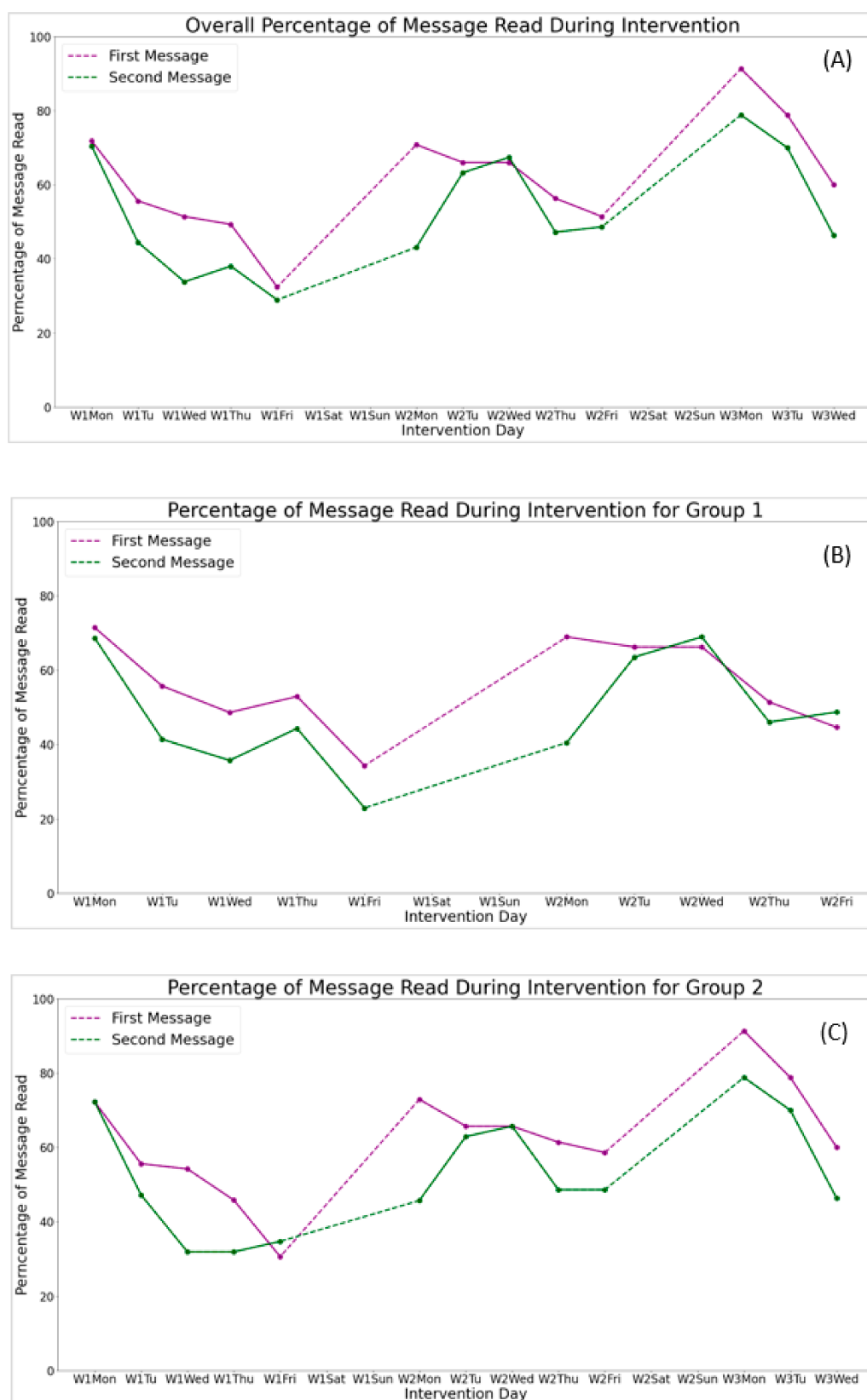
Figure 2. Percentage of messages read by participants during the intervention. (A): Overall percentage of message read during intervention; (B): Percentage of message read during intervention for Group 1; (C): Percentage of message read during intervention for Group 2.