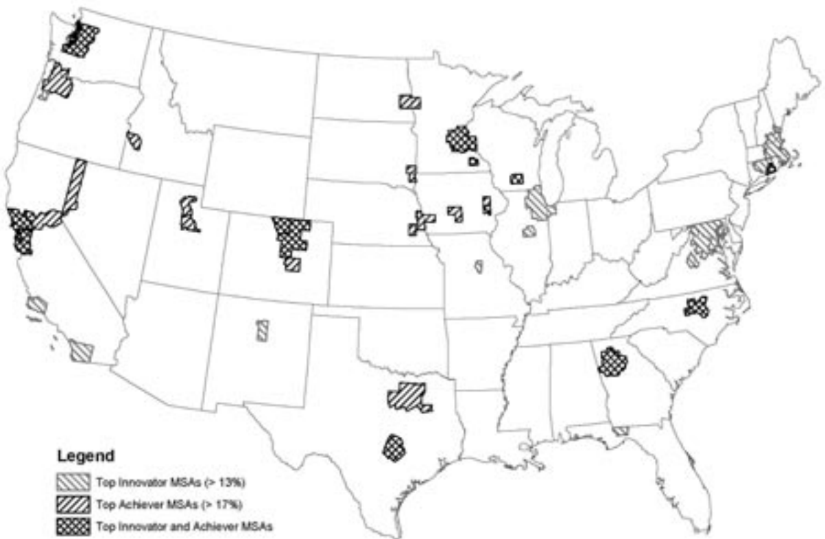
Figure 1: MSAs with Highest Percentages of Innovators and Achievers

Metropolitan Statistical Areas in the coterminous United States with the highest percentages of Innovators (13 percent or more of the adult population) and Achievers (17 percent or more of the adult population).