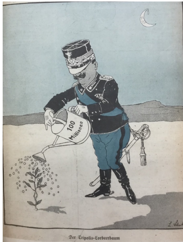
Figure 6.1: The Tripoli Laurel Tree

The man depicted above is an Italian officer bearing the likeness of General Caneva, commander of Italian forces in Tripolitania and Cyrenaica