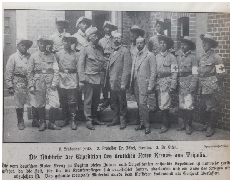
Figure 2.2: “The Return of the Expedition of the German Red Cross from Tripoli” The caption mentions that “the entirety of its valuable materials was gifted to the Turkish Red Crescent.”