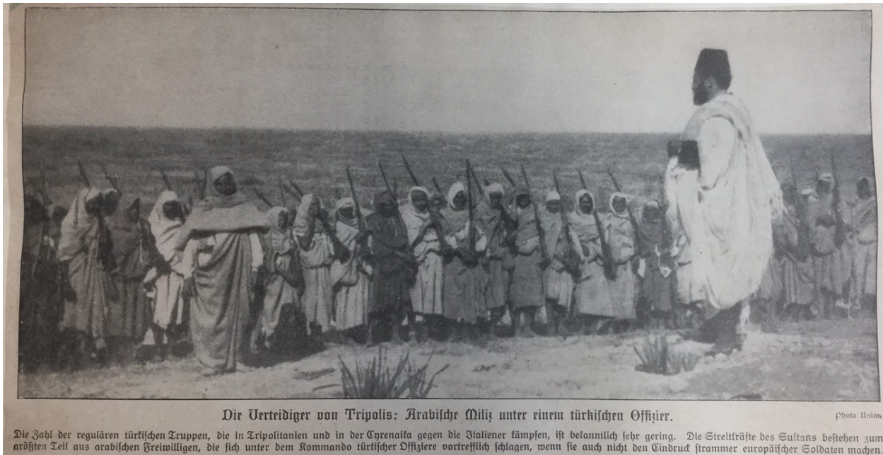
Figure 5.2: “The Defenders of Tripoli: Arab Militia under a Turkish Officer”

“The number of regular Turkish troops who are fighting against the Italians in Tripolitania and Cyrenaica is known to be very slight. The Sultan’s military strength is comprised to a great extent of Arab volunteers who battle admirably under the command of Turkish officers, even if they do not leave the impression of disciplined European soldiers.”