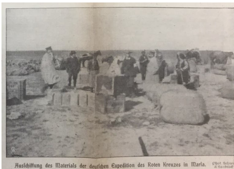
Figure 2.1: The Unloading of the Supplies of the German Red Cross Mission