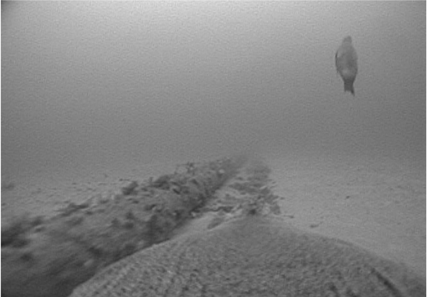
Fig 1. Image taken by animal-borne video camera on a female Australian fur seal foraging along a gas pipeline showing the sessile invertebrates and another fur seal.