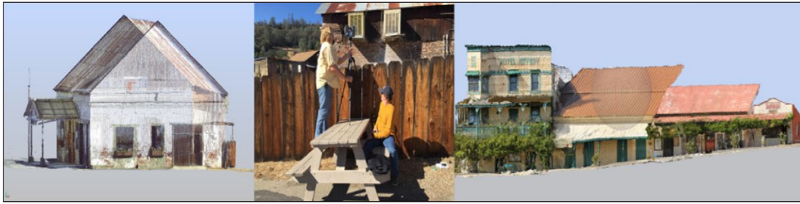
Figure 3: 3-D models of General Store (left) and Jeffery Hotel and adjacent buildings (right).