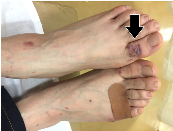
Image 2. Scattered hemorrhagic vesicles (arrow) with purpuric macules on the patient's feet.

Initial laboratory results are shown in Tables 1-3. The patient's electrocardiogram showed sinus tachycardia with normal intervals and without ST-segment or T-wave abnormalities. Bilateral multilobar infiltrates were revealed on chest radiograph (Image 3). A computed tomography (CT) of her chest confirmed the presence of bilateral multilobar infiltrates and a CT of her sinuses showed mucosal thickening throughout. An echocardiogram revealed a normal ejection fraction and no valvular pathology. No vegetations were seen. The patient was admitted to the hospital for further evaluation. A test then was performed, which confirmed the diagnosis.