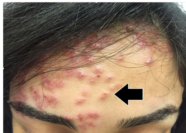
Image 1. Papulovesicular eruptions with petechiae on the forehead of the patient (arrow).

On closer examination of the patient's skin, her rash appeared to have three different morphologies. The first was located on her forehead and consisted of sub-centimeter papulovesicular eruptions with petechiae that were pruritic but not tender (Image 1). The second rash consisted of scattered hemorrhagic vesicles with purpuric macules and was located on her distal upper and lower extremities (Image 2). The third rash was an erythematous and indurated plaque at the base of the left foot, which was tender and made it painful for her to walk.