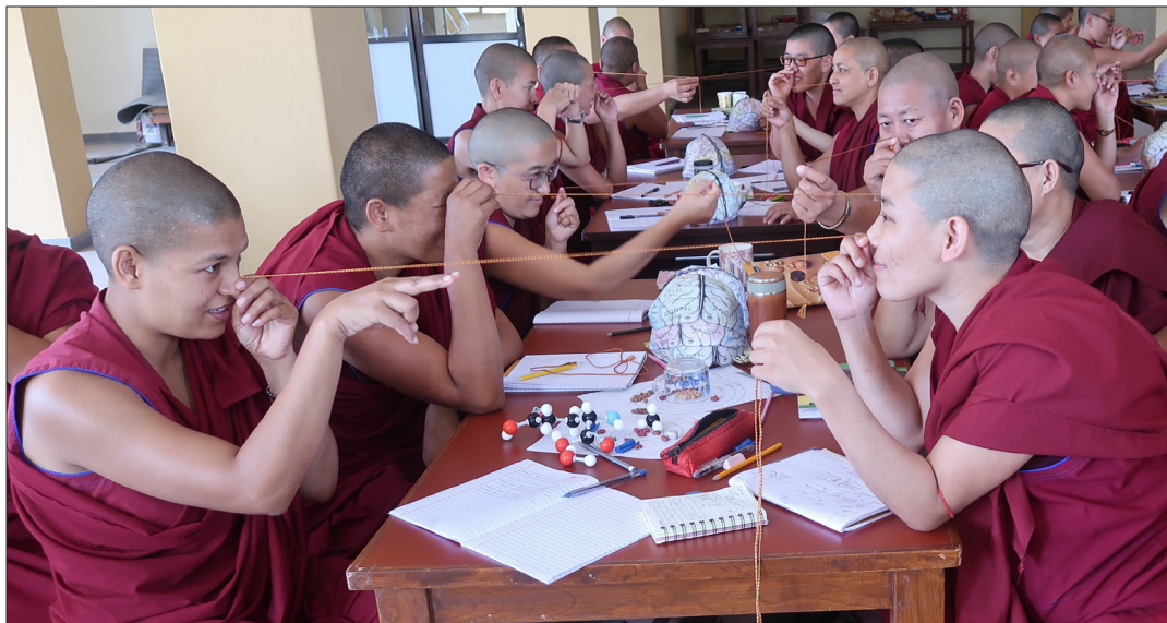
Figure 3: Workshop on sensory neurobiology at the Kopan Nunnery in Nepal (2018).

DP: In our modern scientific tradition, we try to understand the world as detached observers—the essence of our science is objectivity. We build telescopes and microscopes and all sorts of probes to investigate things outside of our mental space. In Buddhism and a number of Asian philosophical traditions, they have a different worldview. The Dalai Lama and others have described aspects of Buddhist tradition as being a kind of internal science. They use contemplative practices to focus inward and deeply investigate the nature of mind. It's not that one's wrong and one's right—they're both right—but they achieve different things. It's easy to see that all of modern technology came out of Western science—the Tibetan Buddhists didn't invent iPhones. But the Western scientific tradition didn't lead to deeply introspective and analytic meditation practices.