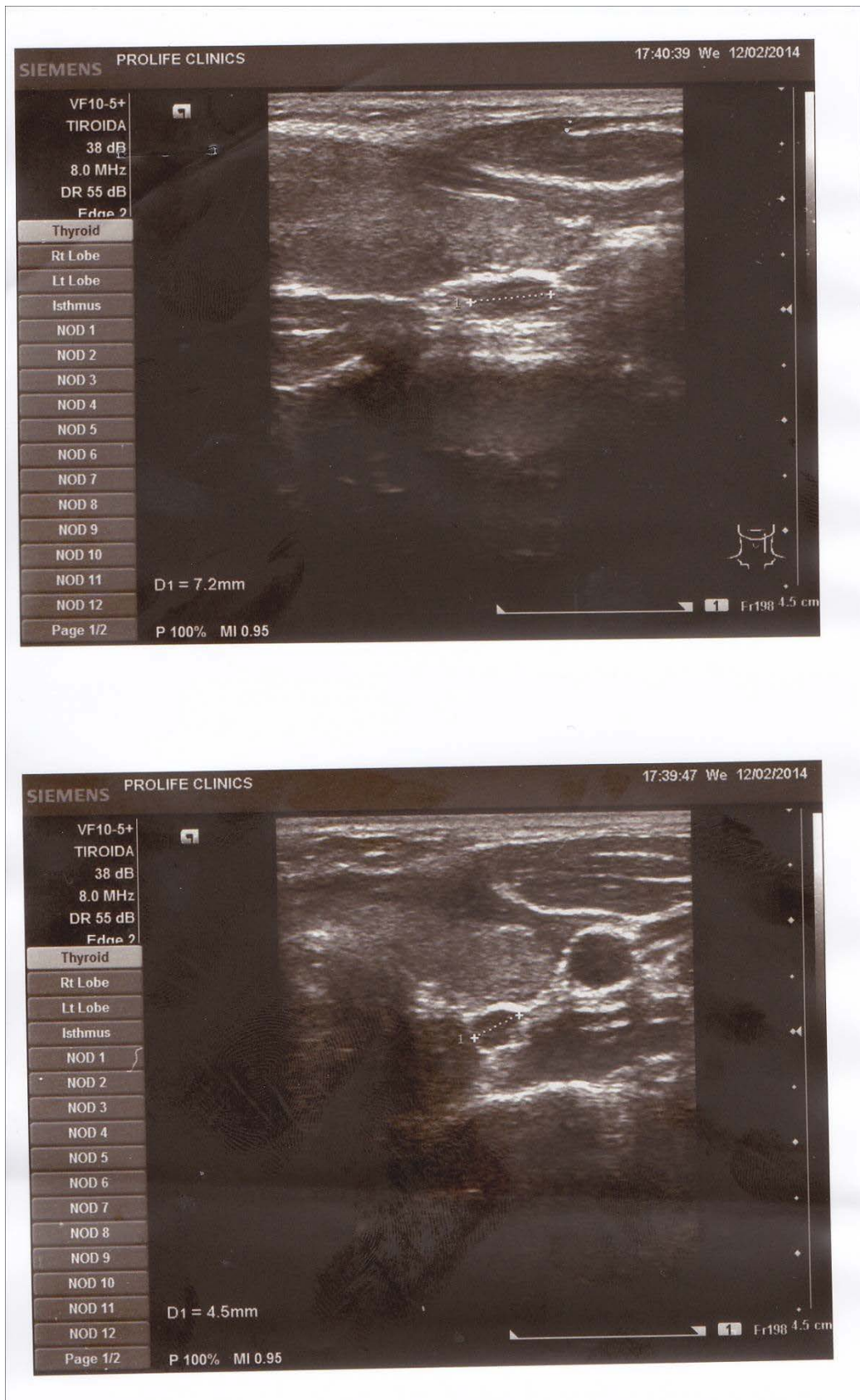
Figure 4. Ultrasound-parathyroid adenoma (arrow); normal aspect of thyroid gland

An endocrinology consultation was requested. Thyroid status proved to be normal but high levels of parathyroid hormone were detected. Ultrasonography evidenced a parathyroid adenoma (Figure 4), but a normal thyroid gland.