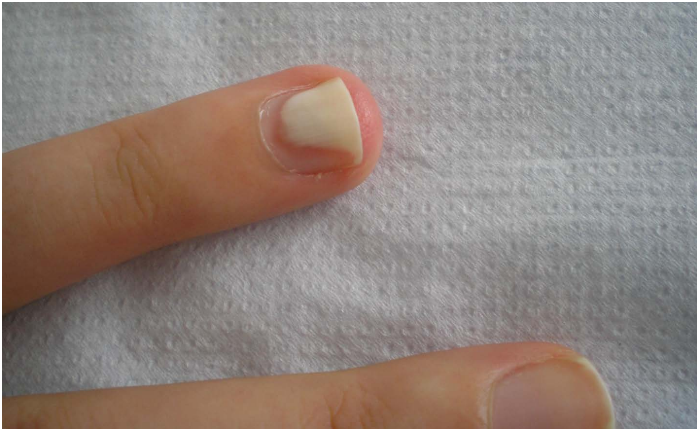
Figure 2. Clinical aspect of the nail

A 22 year old woman came to the dermatology department worried about the peculiar aspect of her 3rd fingernail of the right hand. She noticed the alteration of the nail 5 weeks prior to the medical consult (Figure 3).