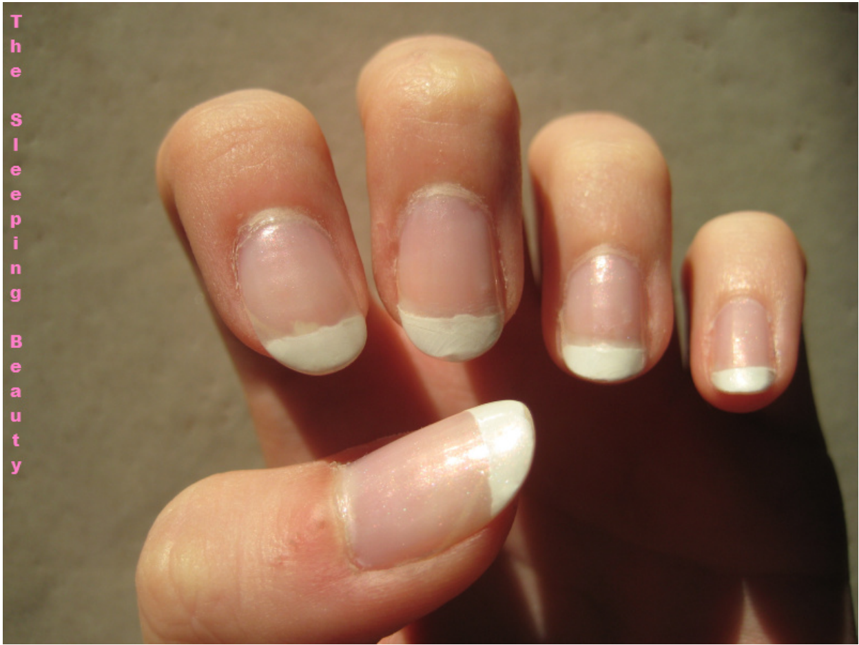
Figure 1. French manicure