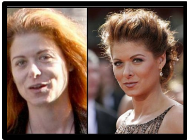
Figure 1. Example stimuli used in this study. On the left is the “unattractive” photograph of Debra Messing that participants saw, and on the right is the “attractive” photograph of the same celebrity.

last (two attractive faces followed by an unattractive face in sequence).