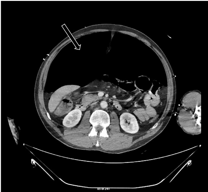
Image 2. Computed tomography of the abdomen with intravenous contrast at the level of the inferior tip of the liver and kidneys showing large pneumoperitoneum, as noted by arrow, with tension physiology.