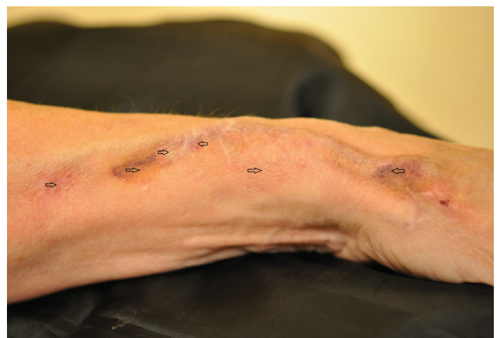
Figure 1. Linearly-arranged atrophic patches with associated telangiectasias, purpura, and ecchymosis, along the course of the left cephalic vein; right-pointing arrows denote areas of atrophy; left-pointing arrows denote telangiectasias and purpura.

A 64-year-old woman, with no prior history of connective tissue disease or atopy presented with a one-year history of fixed patches of purpura, erythematous telangiectasia, and lipoatrophy extending 10cm in a linear fashion along the left lateral forearm ( Figure 1 ). The patient had received two ultrasound-guided triamcinolone injections one year earlier into her left extensor pollicis brevis and abductor pollicis longus tendon sheaths for a diagnosis of DeQuervain tendonitis. The first injection contained 1ml of triamcinolone acetonide 40mg/ml,