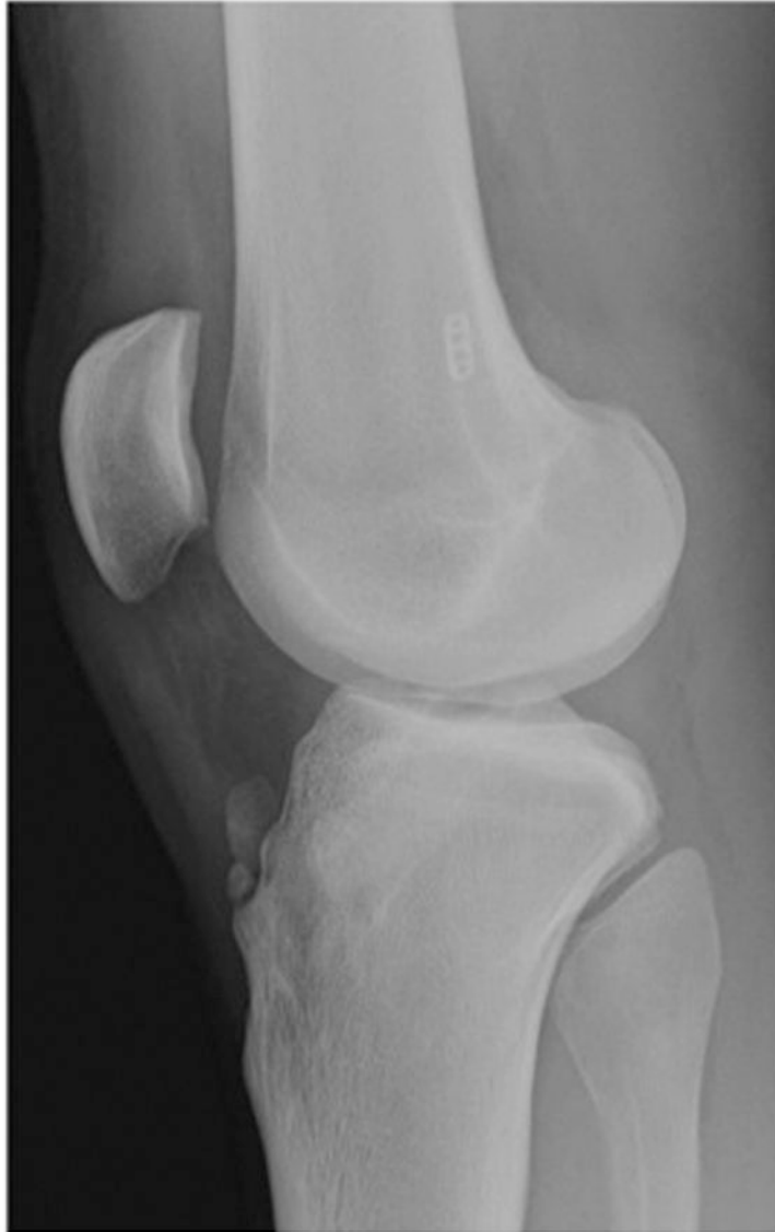
Figure 2. Case #2. Selected radiographic views: 2a: Weight bearing anteroposterior; 2b: 45° flexion-weight bearing (Rosenberg); 2c: 30° lateral; 2d: Full extension lateral. Selected questions pertaining to tunnel location and number of corresponding “Yes” or “No” responses: