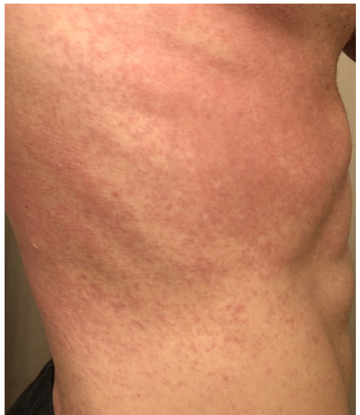
Figure 2. Recurrent morbilliform eruption on the right flank with flesh-colored papules on the posterior right flank.

Herein, we report a case of morbilliform rash secondary to the Pfizer-BioNTech COVID-19 vaccine, like that seen in COVID-19 infection. The presence of similar eruptions in SARS-CoV-2 positive patients and in this patient following vaccination with a mRNA vaccine suggests a similar underlying etiology of immune activation leading to the development of a morbilliform rash [7]. An immune-mediated etiology is plausible in our patient's vaccine-related rash, as it was recurrent and notably more extensive following the second dose of the vaccine suggesting a more robust immune response. Thus far, rash has not been