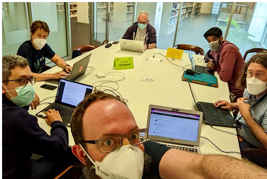
Figure 10. Some of the in-person CoFest 2022 participants working together at the Madison Public Library. Shared under a CC-BY-SA license .

Description Language (WDL) workflows into a 5-minute lightning presentation to help make up for an otherwise catastrophic delay earlier in the session due to technical issues.