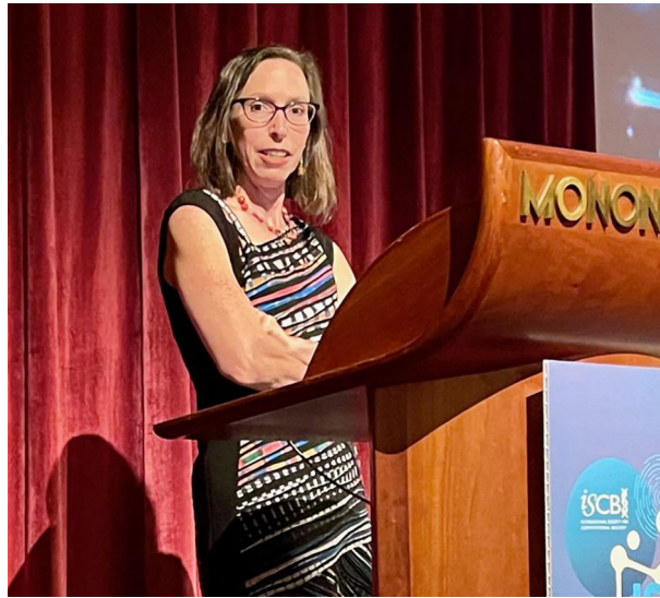
Figure 5. In a joint BOSC/Bio-Ontologies session, keynote speaker Melissa Haendel took attendees on a fast ride down the translational highway with the help of ontologies. Shared under a CC-BY-SA license .

discussed in different studies are in fact equivalent? Melissa leads projects such as the Mondo disease ontology, the Human Phenotype Ontology (HPO), and the LinkML data modeling language, which aim to help address those challenges. Melissa discussed ways to bridge the translational divide by leveraging semantics and ontologies — with the caveat that in most cases, if you think you need to invent a new ontology, you actually don't.