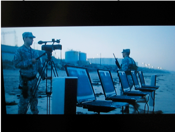
Figure 4: A war machine connecting video cameras, weapons, and laptops