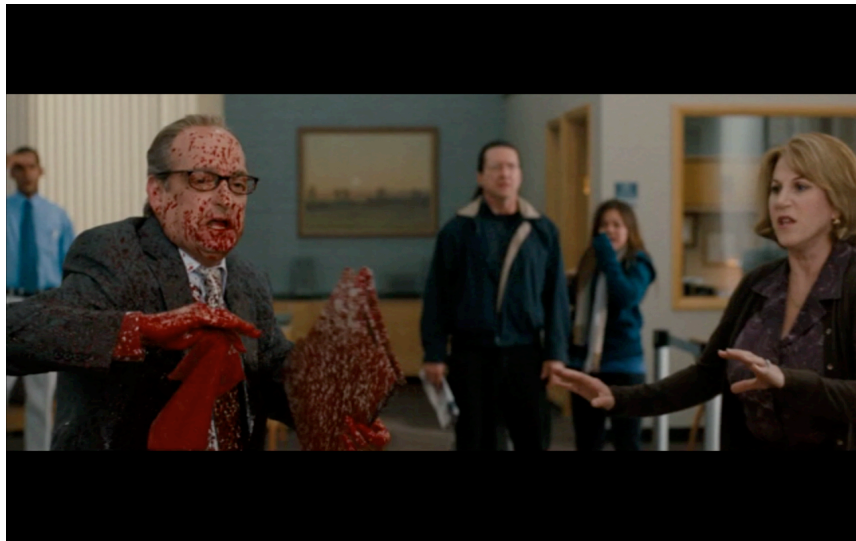
Figure 5: Mr. Jacks covered in blood

nonspeculative investors like pension plans, small banks, and local governments—has a contaminating effect even without the volition of the contaminated. In an earlier scene, Christine herself becomes, like Mrs. Ganush, a horror image of liquidity, spewing copious blood from her nose—whereas Dracula is frightening because he siphons-off the circulatory medium, Christine is frightening because she spreads it around. Mr. Jacks, who is standing in front of her, is drenched in blood, but his real concern is about the possibility that he has ingested some: “Did I get any in my mouth?”, he asks frantically. As in the discourse of CDOs as “toxic waste,” in other words, the concern of the film is with contamination: the free flow of liquid money that served in 18 th century narrative as the basis for a utopian imagined community, and that for early 21 st century investors was the ultimate and perfect expression of a fully financialized mode of profitability, must now be prevented, lest its poisonous toxicity spread throughout the social order.