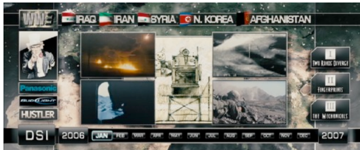
Figure 1: A CNN-style image of war

futural) 2008. The next scene, which fills us in on what has happened between 2005 and 2008, is also mediated, through what at first appears to be the highly formatted aesthetic of television news media (one review called it a “hyperkinetic Fox News-style summary”). Along one side of the image are advertisements for beer, stereos, and pornography, while a newsfeed type scrawl lists the sites of “WW3” (Iraq, Iran, Syria, North Korea, Afghanistan) at the top and the dates of attacks at the bottom.