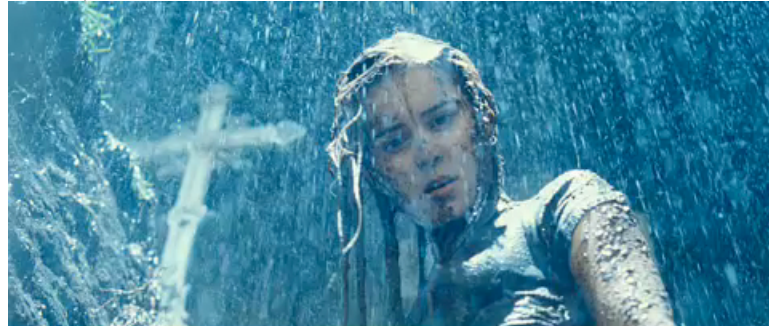
Figure 6: Christine as "last girl"

bloodlust of the classic slasher tradition, this scene codes Christine as what film scholar Carol Clover famously calls the “last girl”: the female protagonist with whom we identify and whose traditionally bloody, but here simply muddy, triumph over her monstrous antagonist fulfills the slasher film’s revenge fantasy. 23