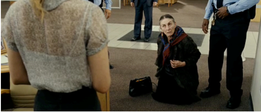
Figure 2: Mrs. Ganush begs Christine for "a little time"