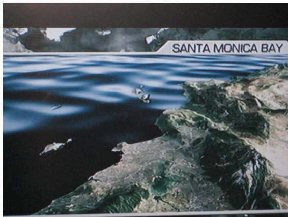
Figure 3: A computer-drawn image superimposed over a map, as in a tactical simulation

Thus rather than read Southland Tales ’ multi-media references solely in terms of their relationship to what new media critic Tom Abba describes as “Alternate Reality Games” in which “the narrative reality of these source storyworlds is taken as genuine” and “the interactive reader continues [to have] a part in the endeavor of building worlds, both fictional and real,” we should read the film as a response to the way the conjoining of warfare with the experience of “storyworlds” as a “genuine” reality produces potentially catastrophic results. 31 The “Alternate Reality Game,” after all, takes perhaps its most common form not in postmodern film but in the Urban Warrior game, which Der Derian writes emerged as a large-scale form of entertainment