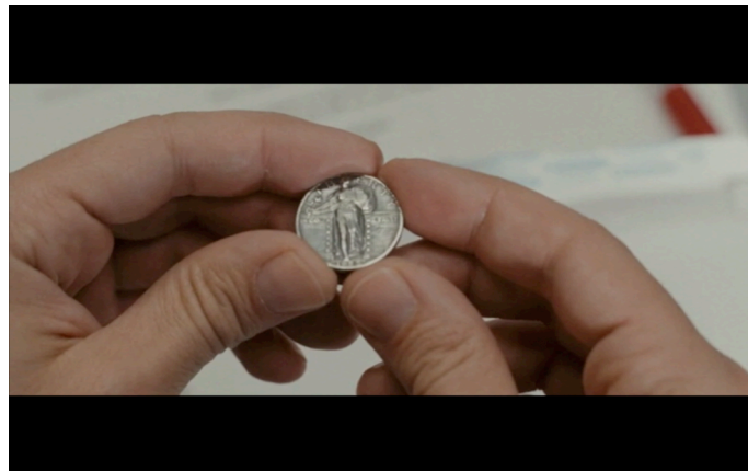
Figure 3: The 1929 "Standing Liberty"

All of these critical accounts emphasize the impersonality and indistinguishability of the traveling coin. The coin which is both a central symbol and a crucial plot element in Drag Me to Hell , by contrast, is marked by its rarity and its particularity: early in the film, Christine gives Clay, her professor boyfriend, a rare coin she came across at the bank; Clay, an amateur numismatist, recognizes its value immediately: “It's a 1929 standing Liberty, and it's almost fully struck,” he says in nerdy wonderment. “You found this in regular circulation at the bank?”