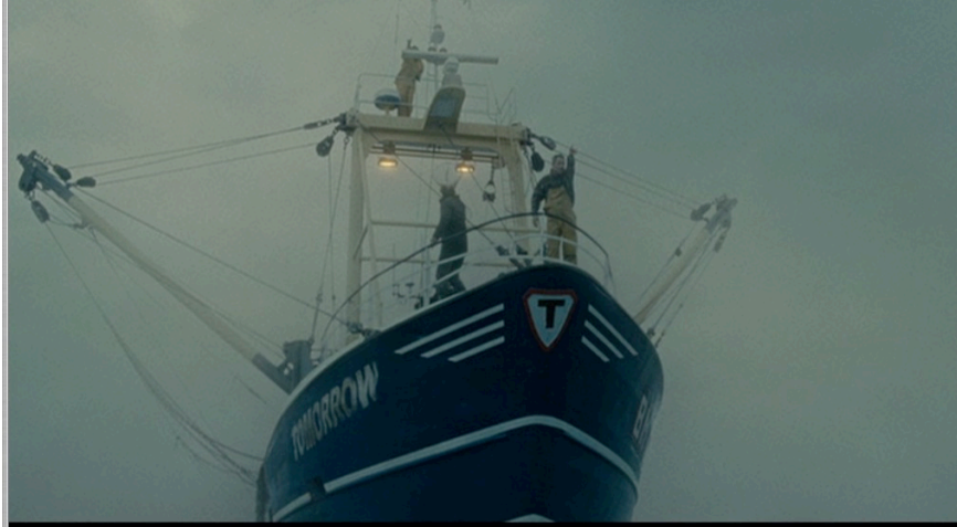
Figure 1: The ship called "Tomorrow," sailing out of (and then back into) the fog of history