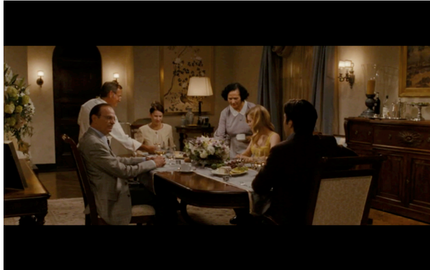
Figure 7: Clay's parents served at dinner

On the contrary, it is Christine who can only get $3800 for all her earthly possessions, “including the jewelry”; Christine who we are first shown listening to elocution tapes so that she can speak “like a professional”; Christine who is victim of sexism and boys-clubism at her work. In other words, our pleasure in watching Christine be tormented as the stand-in for the sins of the credit economy is tempered both by the film’s representation of the malfunction of the scapegoat or sacrifice and by the fact that the narrative clearly figures Christine as the soul who pays the price for a machine in which she is the tiniest, most insignificant cog, no more responsible than the bank teller that Clay’s mother imagines drearily counting other people’s money. The relationship between Christine and Mrs. Ganush is thus neither monster and hero nor hero and monster, but doubled victims.