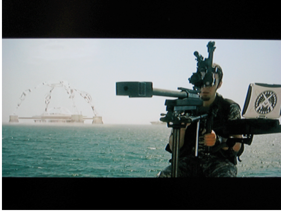
Figure 6: Pilot Abilene, robotically merged with his gun and laptop