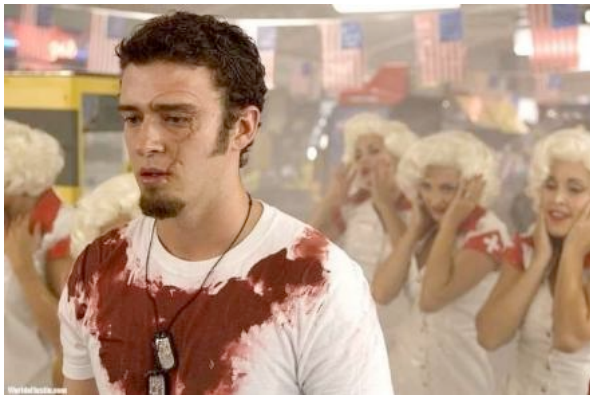
Figure 7: "I've got soul/But I'm not a soldier"