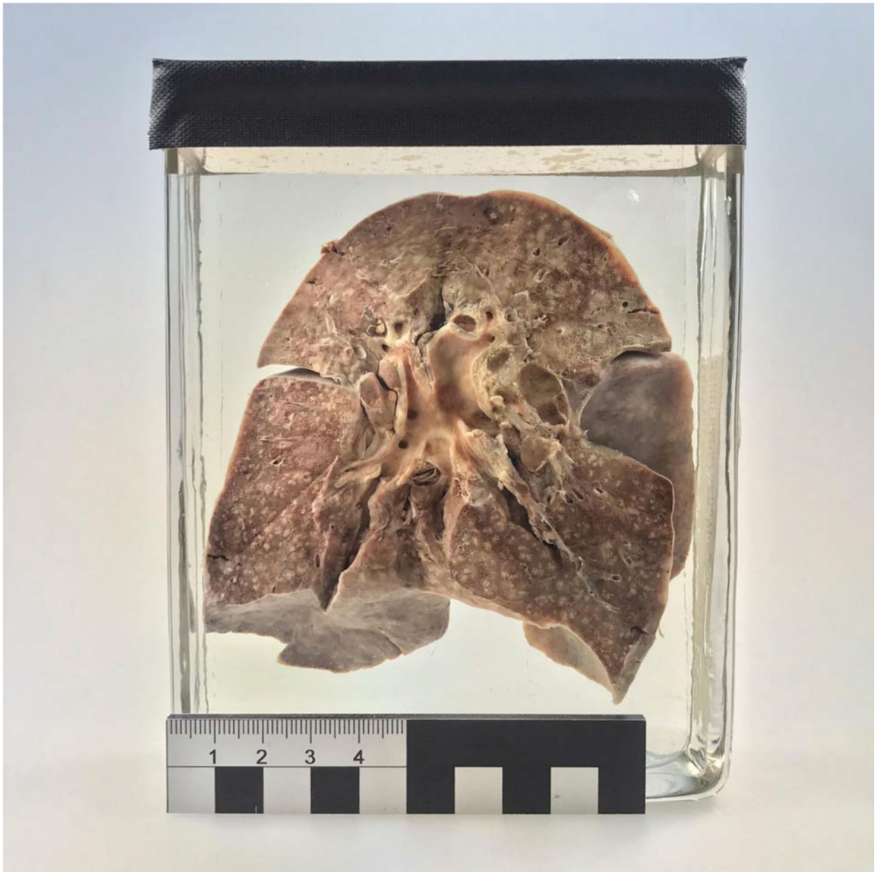
Fig. 1. Formalin-fixed lung specimen collected in 1912 in Berlin from a 2-year old girl diagnosed with measles-related bronchopneumonia (museum object ID: BMM 655/1912).