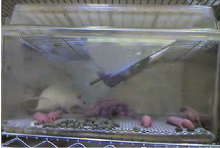
FIGURE 2. Photograph of a cage at the moment of onset of the limited bedding/nesting chronic early-life stress paradigm in rats. Note the fine, plastic-coated aluminium-mesh floor and the shredded paper towel. The cage is placed on a metal cart.