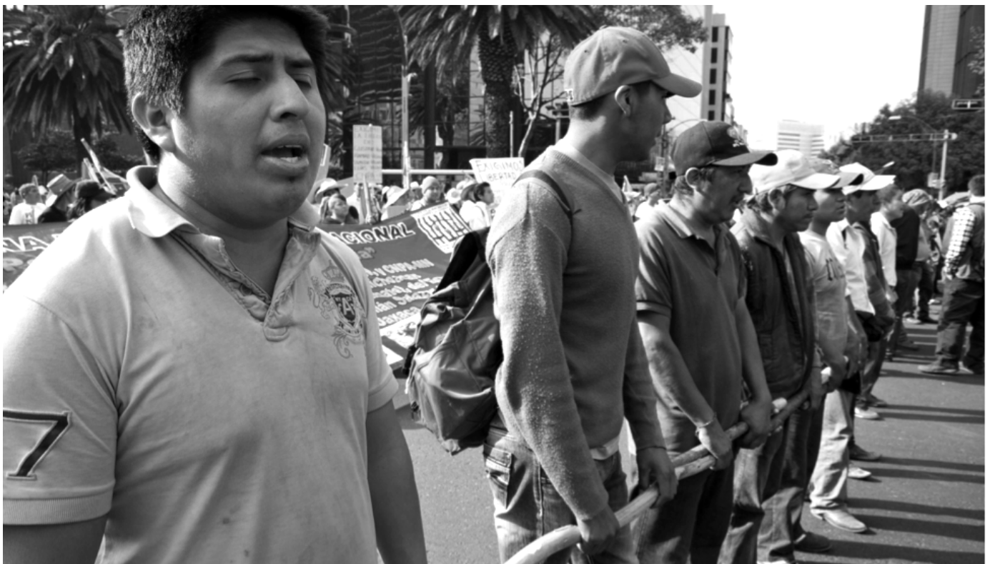
Protesters, Mexico City, January 2014.