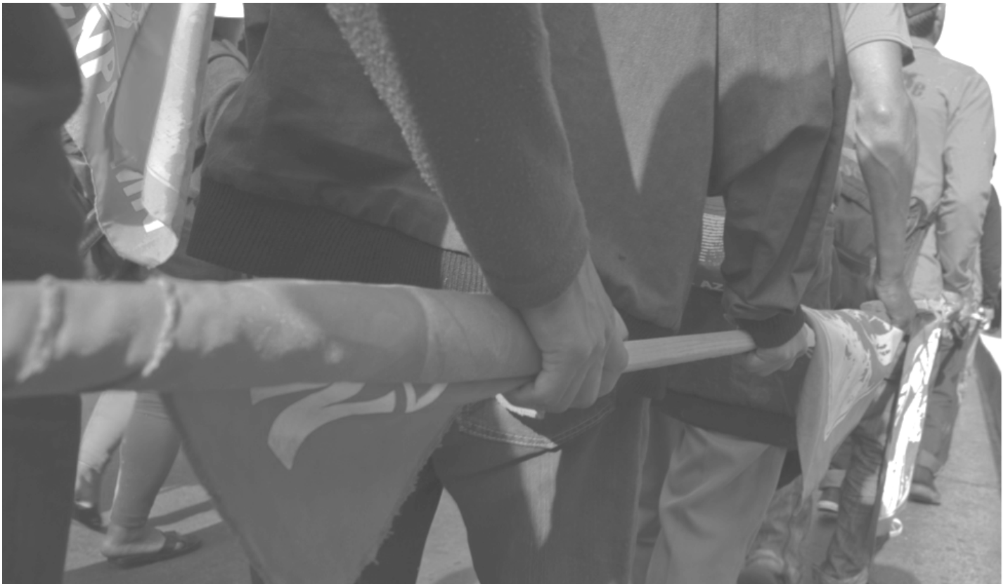
Protesters, Mexico City, January 2014.