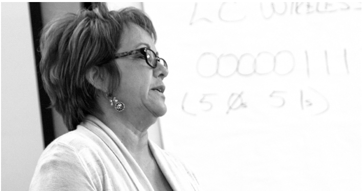
María Elena Durazo

deficits it caused, along with the movement of production, led to the direct loss of 682,900 jobs by 2010. “Contrary to official predictions, NAFTA led to growing U.S. trade deficits with Canada and Mexico, not trade surpluses,” an EPI report noted. “More jobs were created in Mexico (30,400) by the growth of net exports of autos and auto parts to the United States in 2010 than were created in the entire U.S. auto industry in the same period.”