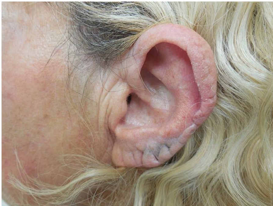
Figure 1. The left ear lobe of Patient 1 shows blue-gray discoloration on the anterior surface of the ear lobe.

Patient 1 is a 68-year-old woman who presented with blue-gray discoloration of her anterior and posterior distal helical rims and ear lobes surrounding the sites of ear piercings. Both the left and right ear lobes were similarly affected (Figure 1).