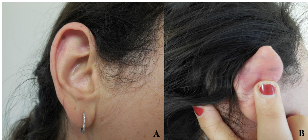
Figure 4. Anterior (A) and posterior (B) views of a 3 x 3 millimeter blue-black colored macule affecting the anterior and posterior right external ear near the site of a piercing on the helix of Patient 2.