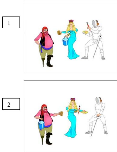
Figure 1: Example of a picture pair for Experiment 1

Design A set of 24 items was created. Each item consisted of 4 spoken sentences and 2 pictures (see Table 1 and Figure 1). There were 2 versions of each image, which only differed in the characters' roles; depiction of actions as such did not change. One character on each image was role-ambiguous (agent/patient, 'acting and being acted upon'), engaged in 2 events (e.g. washing/painting event); the other two were unambiguously agent and patient, respectively. Actions were typically depicted as a character holding an instrument. For each visual scene there were two sentences describing the characters and their actions. One sentence per image had a canonical SVO word order whereas for the second sentence of each picture the word order was OVS (cf. Table 1). Conditions were matched for length and frequency (CELEX, Baayen, Pipenbrock & Gulikers, 1995). For images (1) and (2) (Figure 1), for instance, the sentences in Table 1 were recorded.