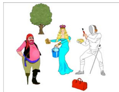
Figure 3: Example for image with distractor items

The basic design, procedure and analysis were exactly the same as described for Experiment 1. Two distractor objects were added on each image (cf. Figure 3). Linguistic materials differed only in that we included the original unchanged version and a cross-spliced version for each item sentence. One item set thus consisted of 8 sentences (4 original, 4 cross-spliced) and 2 images.