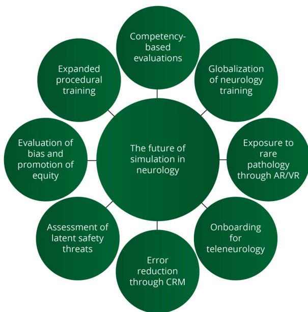
Figure 1 The Future of Simulation in Neurology

An overview of the many areas in neurology training where simulation may be applied. AR = augmented reality; CRM = crisis resource management; VR = virtual reality.