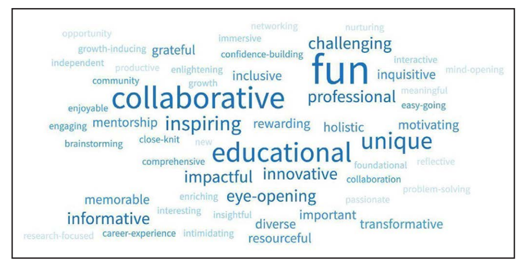
Figure 2. Word cloud displaying adjectives used to describe THINQ. Abbreviation: THINQ, The Healthcare Improvement and Innovation in Quality.

Responses to the questions "What would you say were the most important things you learned or gained from THINQ?" and "Did your time with THINQ influence your personal/career goals?" organized into 6 categories encompassing THINQ's mission. Some responses have been edited or paraphrased for length and clarity. THINQ Tanks are internal competitions modeled after the show Shark Tank , where students pitch their solutions to improving health care specific issues. Abbreviations: QI, quality improvement; THINQ, The Healthcare Improvement and Innovation in Quality.