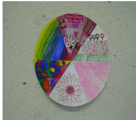
Figure 3. Art mandala 2