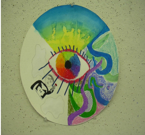
Figure 2. Art mandala 1