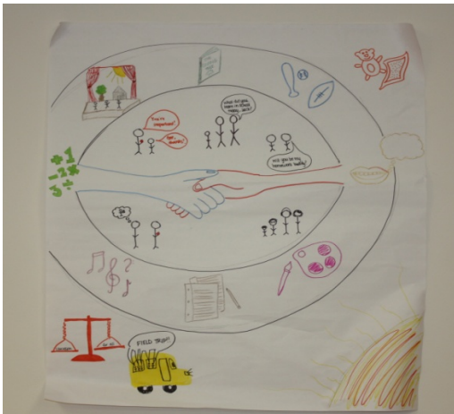
Figure 9. Group 2 mandala 2

From these statements, students were then asked to return to their original mandalas, examining how their views have evolved over the course of the semester. Groups received another copy of the handout that had been distributed at the beginning of the semester, as well as the original mandala that they had created. Reflecting carefully upon the evolution, considering where the “we believe” statements might fit, as well as anything else they felt was important to include, students were invited to disrupt their original mandalas. The disruption meant to be a practical way to (re)create a representation of their understanding in relationship to education, but also served as a metaphor to illustrate the fluid nature of experience and knowing. Students were given an option with regard to how they disrupted the mandala. For instance adding images to the original, throwing away the original, cutting or ripping the original and (re)piecing, as they added new images and words to the present creation. Given the materials that were available and the nature of our classroom community, there was flexibility in terms of the way the mandala was developed—while the aim was the circle, how the circle actually looked was not limited to an exact circle.