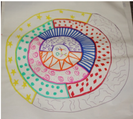
Figure 5. Group 1 mandala 1

As students worked in their groups, discussion remained focused on the questions, but also reflected a sense of timidity in relationship to the aesthetic process and anxiety regarding the quality of workmanship and entering into relationships with unfamiliar individuals. Within this space, as students shared their own education experiences, opinions, and beliefs regarding the nature of teaching and learning, what works and what doesn’t, an interesting rhythm ensued, where slowly, what started as anxiety grew into an appreciation for diversity—both in terms of talent as well as experience. Along with that appreciation, assumptions were uncovered. For instance, the one all-male group felt that they should have a female in the group to help them draw better. Along with the recognition that there could be different ways to communicate ideas came the recognition that they might be in words, but that symbols, too, could serve to answer the question(s) being considered.