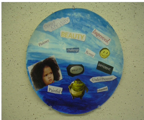
Figure 4. Art mandala 3

The purpose of this was to provide them with multiple models that were consistent with what other non art major college students might produce, helping to clarify expectations, while also limiting some of the initial anxiety that might exist when one is given a “perfect” model. They were then asked to work with their peers to share their personal