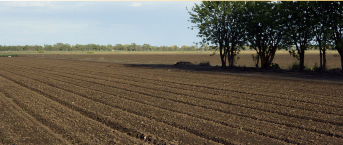
Figure 3. Low-organic-matter composts usually contain a good deal of soil. It takes twice as much material for a 25-percent-organic-matter compost to provide the same conditioning benefits as a given amount of 50-percent-organic-matter compost.