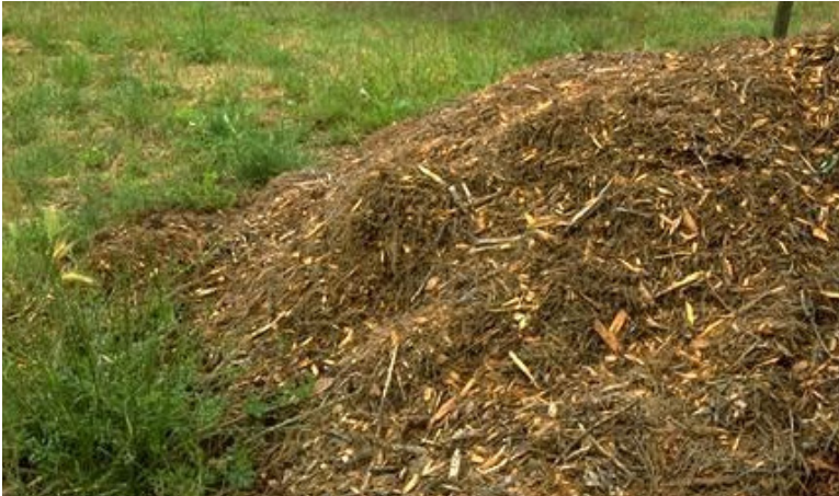
Figure 2. Wood chips have a high C:N ratio (on the order of 600:1), while dairy manures have a lower ratio (on the order of 15:1). Of the two, woody composts decompose more slowly, but manure-based products supply more nitrogen.